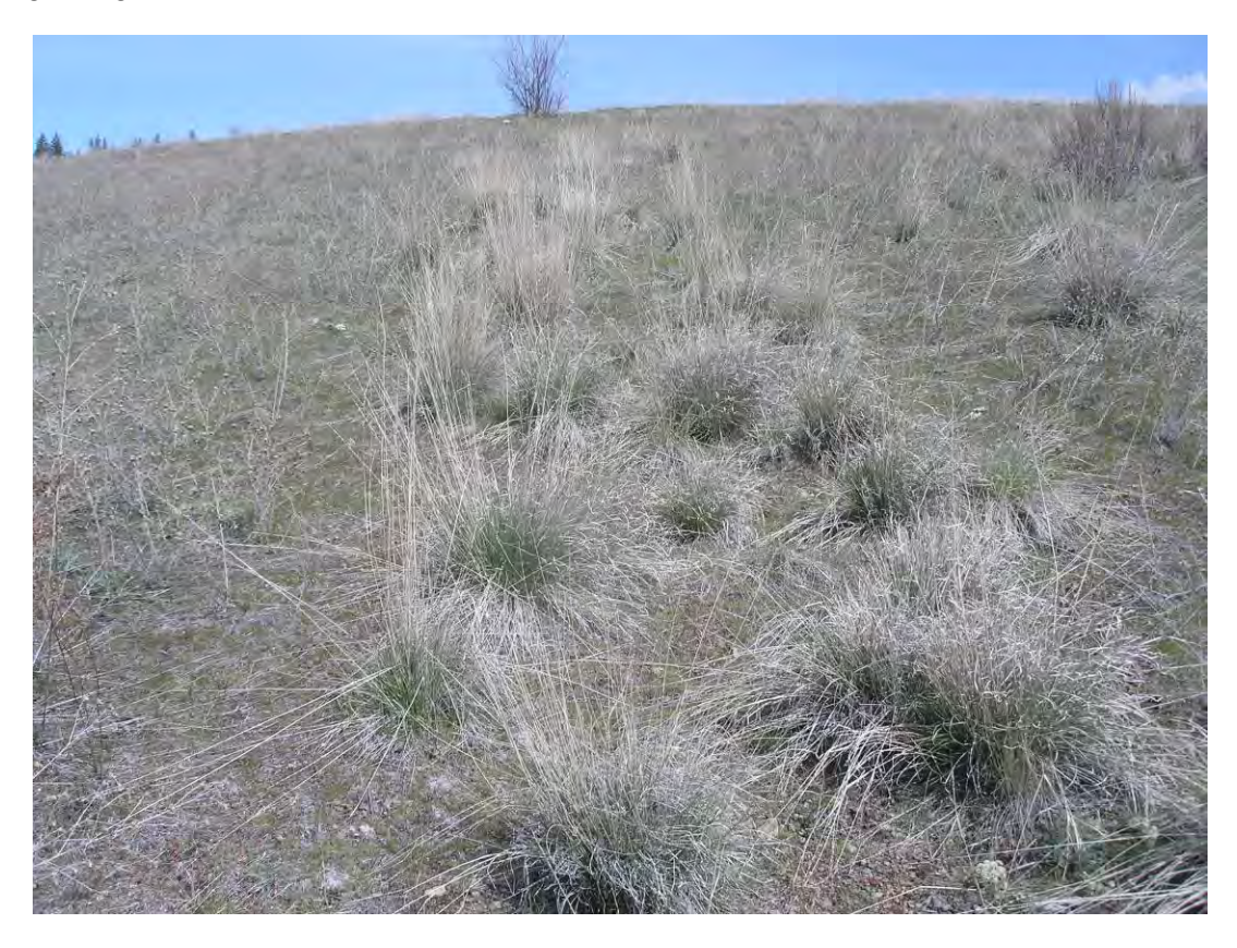
Figure 1. Ten-year-old bluebunch wheatgrass seeded into spotted knapweed near Plains, Montana.

A field trial tested herbicide applications in conjunction with perennial grass seeding to manage invasive annual grasses and restore perennial grasses to two invaded rangeland and pasture sites in Sanders County, Montana. After nine years of evaluation, the results suggest using 12 ounces of imazapic (Plateau®), or a mixture of 6 ounces of imazapic plus 6 ounces of glyphosate, prior to a fall dormant seeding for best results. Sow pubescent wheatgrass if a non-native grass species is desired or bluebunch wheatgrass if a native grass species is desired. After the grasses had established for five years, pubescent wheatgrass tolerated annual grazing by cattle whereas bluebunch wheatgrass declined without one or more years of recovery from cattle grazing.