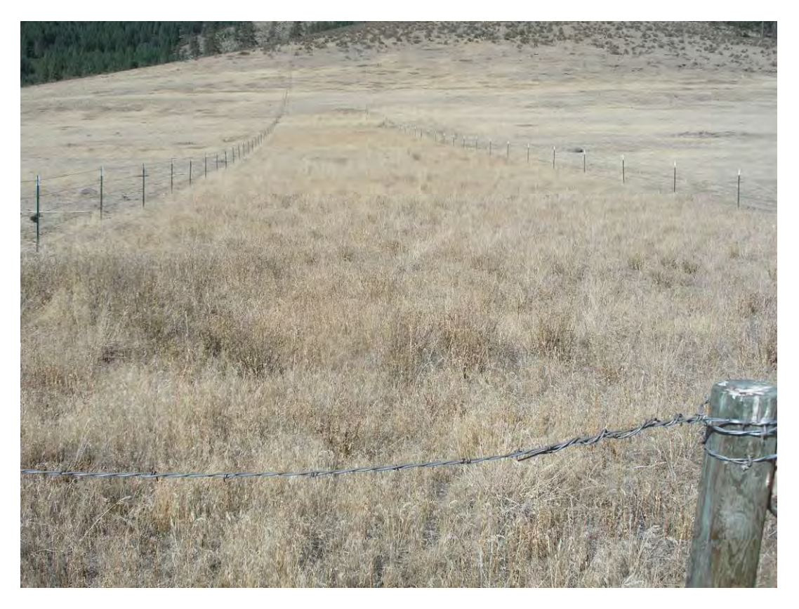
Figure 2. Cheatgrass biomass buildup in pastures is a wildfire hazard (Camus Prairie, Montana).

Large areas of rangeland and pasture in western Montana have degraded plant condition with inadequate structure and composition to achieve an acceptable level of ecological function. As a result of various factors such as drought, fires, and grazing, the structure and composition of these plant communities have changed over time from predominantly diverse native perennial plant species to communities dominated by non-native grasses and forbs, many of which are listed as noxious. Inventories of degraded sites list cheatgrass ( Bromus tectorum ), bulbous bluegrass ( Poa bulbosa ), spotted knapweed ( Centaurea stoebe ), sulfur cinquefoil ( Potentilla recta ), common St. Johnswort ( Hypericum perforatum ), and Dalmatian toadflax ( Linaria dalmatica ) in areas with degraded plant condition. Where these plants dominate, forage and biomass production is below potential, season of use is limited, and areas are avoided by livestock and wildlife because of toxic weeds. Secondarily, these communities have exposed soil subject to erosion, or have biomass accumulation that can increase wildfire frequencies and intensities. In addition, the quantity and quality of cover and shelter is inadequate to meet the requirements of wildlife species.