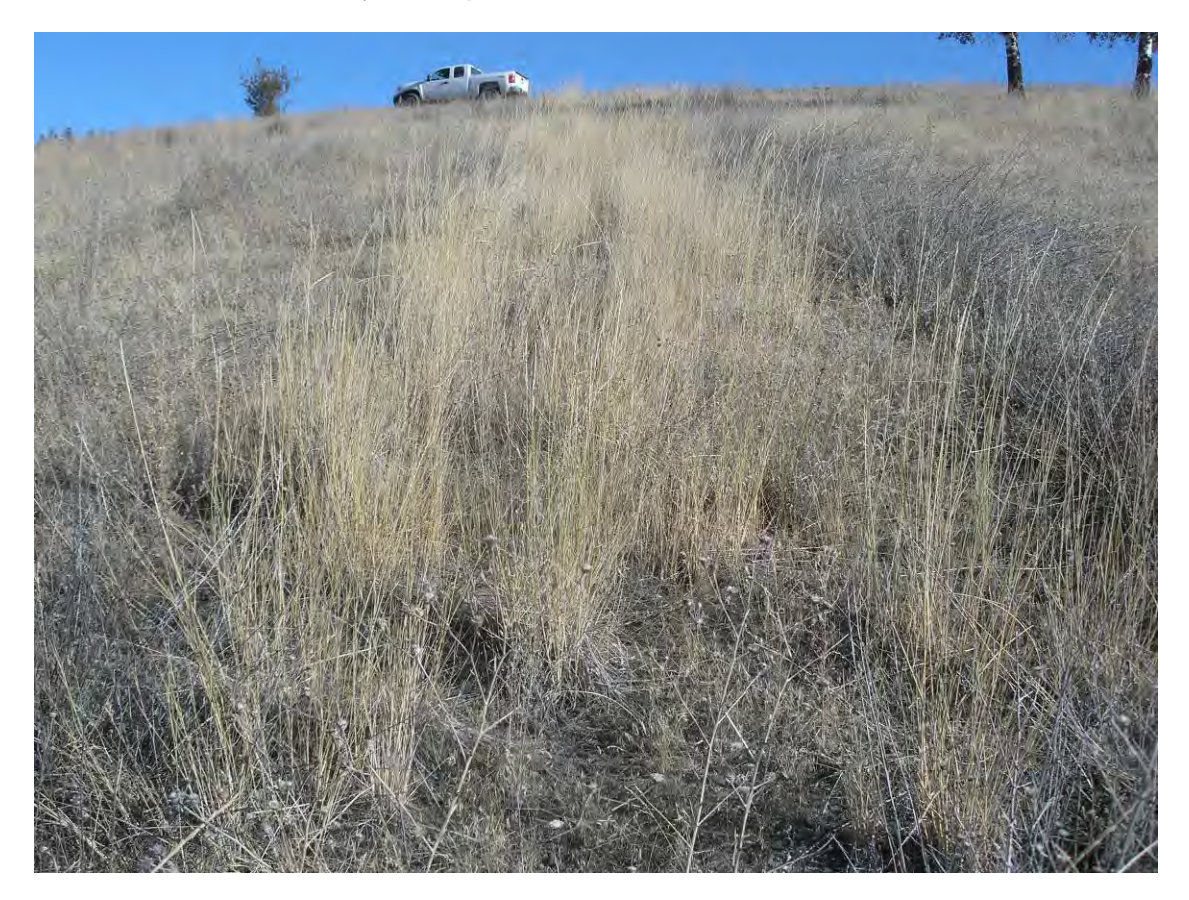
Figure 4. Pubescent wheatgrass plots at Plains after five growing seasons.

but stand failure in the no-herbicide and imazapic treatment plots. The crested wheatgrass stand was rated "very poor" where glyphosate and imazapic were sprayed, "poor" where imazapic was sprayed, and "failures" in the glyphosate and no-herbicide plots. The Russian wildrye stand was "very poor" where glyphosate was sprayed and "failures" where imazapic, imazapic plus glyphosate were sprayed, and in the no-herbicide plot. Orchardgrass and smooth brome failed to establish in any of the plots at the Plains site.