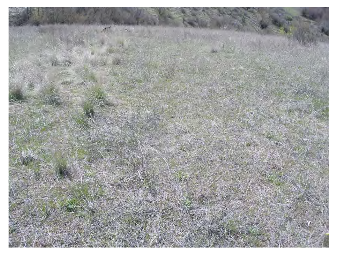
Figure 5. Bluebunch wheatgrass plots at Plains nine years after seeding.

At Camus Prairie, during the year three evaluation, we observed for the first time, "fair" stand establishment of bluebunch wheatgrass in the glyphosate plus imazapic fall-seeded plot. It was also the first time we observed "fair" stands of pubescent wheatgrass in the fall seeded and herbicide treated plots, but not in the fall seeded no-herbicide plot. All other grass plots in both the fall seeding and spring seeding failed to establish.