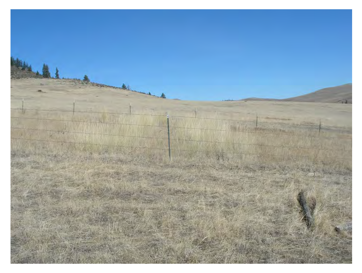
Figure 6. Pubescent wheatgrass plots at Camus Prairie at the year five evaluation before the site was opened to grazing.

Nine years after seeding, and after four years of cattle grazing at the Camus Prairie site, we observed "excellent" stands of evenly grazed pubescent wheatgrass where it was seeded in the fall and where herbicides were sprayed. The "good" stand of bluebunch wheatgrass seeded in the fall where glyphosate plus imazapic was sprayed had diminished to a "poor" stand. All other grass by herbicide combinations were failures.