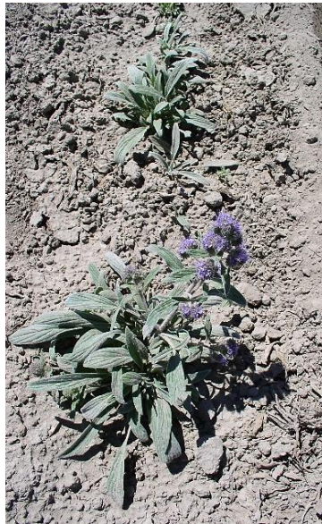
Silverleaf Phacelia ( Phacelia hastata)