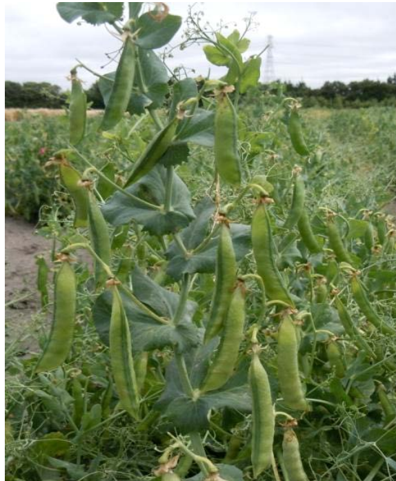
Mature Pea Plant with Pods

Pure stands of peas should be direct-combined from dried windrows to prevent pod shattering. Specialized pickup reels with fingers or spring-loaded lifters on the combine header may be used if the peas are lodged at harvest. To prevent seed cracking, harvest-time adjustments need to be made to the combine reel speed, cylinder speed, and the distance between concaves. The average seed yields in Montana from 2008 to 2012 were: Austrian winter peas 1,000 pounds per acre and dry edible peas 1,482 pounds per acre.