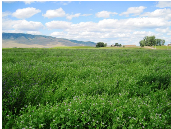
Austrian Winter Pea Cover Crop in Lake County, Montana

Pea seedlings can withstand considerable frost. Even if the frost is severe enough to kill the main stem, peas may re-grow from buds near the soil surface. Due to this setback in growth, however, plant maturity will be delayed. Seed germination rate increases with rising soil temperatures above 55° F, but at temperatures greater than 64° F, the percentage of seed germination decreases. Because of these growth traits, Washington, North Dakota, and Montana are the top three pea producing states in the U.S.