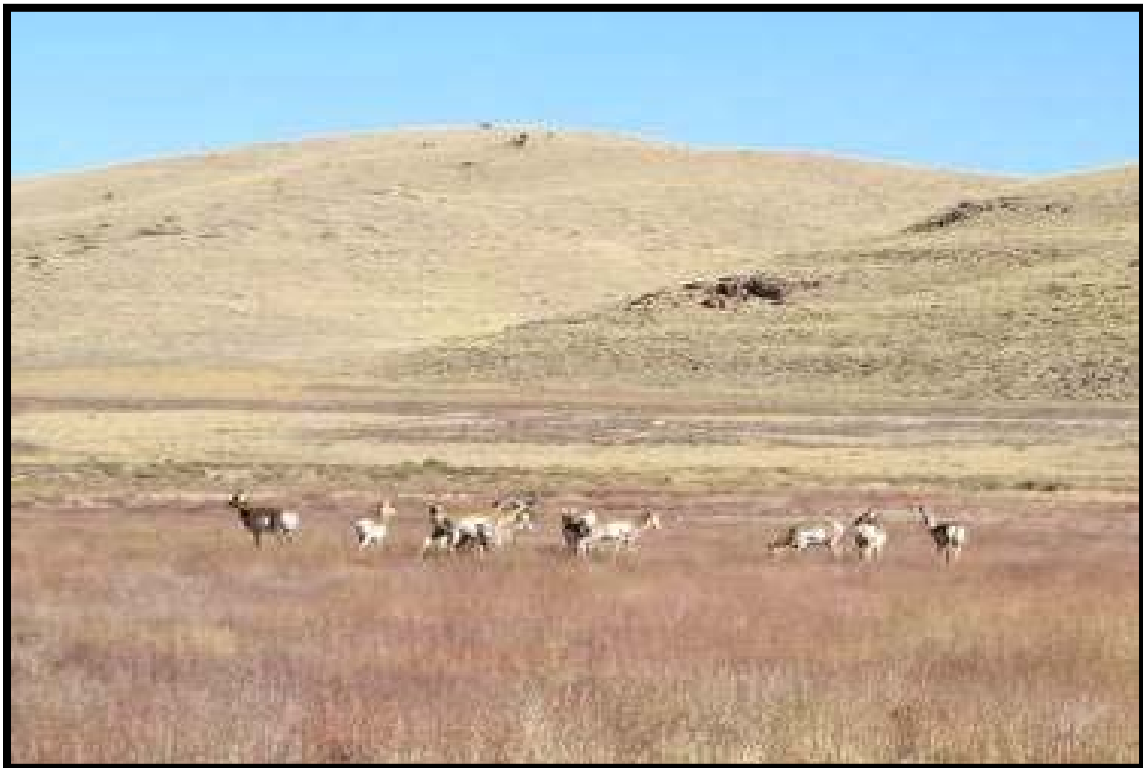
Antelope on a Green Strip Planting of 'Immigrant' Forage Kochia