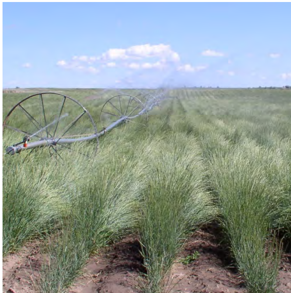
Slender wheatgrass seed production field at Aberdeen, Idaho.

Contributed by: USDA NRCS Idaho Plant Materials Program