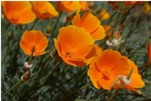
Figure 1. California poppy in bloom.

Contributed by: USDA NRCS Plant Materials Center, Lockeford, California