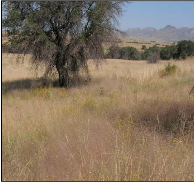
Figure 1: Plains lovegrass reflects a pink hue in the grasslands of Arizona.

A Conservation Plant Release by USDA NRCS Tucson Plant Materials Center, Tucson, Arizona