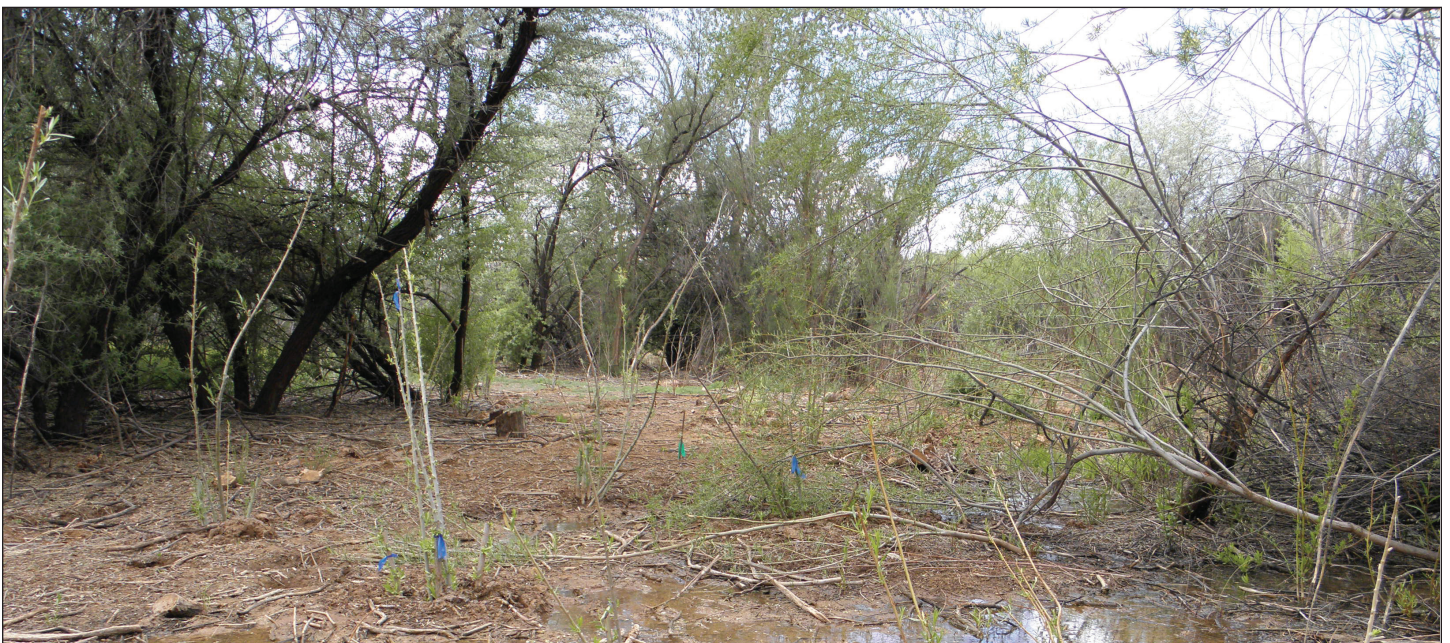
Figure 7: Willow pole plantings in an area cleared of tamarisk.

Table 3 is a listing of trees and shrubs, along with their establishment methods, that are frequently used in riparian area restoration. The availability of shrub and tree species listed in table 3 is currently very limited with only a few specialized growers producing some of these woody plants.