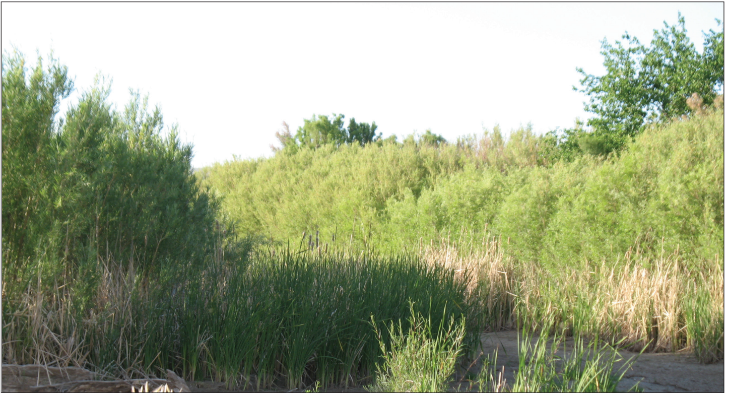
Figure 2: Southwestern willow flycatcher habitat on the Lower Rio Grande near Hatch, NM.

Habitat characteristics such as dominant plant species, size and shape of habitat patch, tree canopy structure, vegetation height, and vegetation density vary widely among breeding sites. Breeding habitats are broken into categories based on the composition of the tree/shrub vegetation at the site.