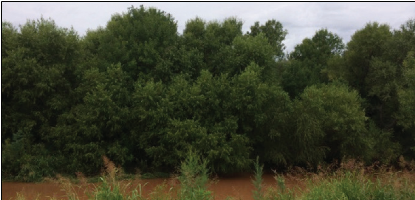
Figure 3: Native broadleaf habitat along the Verde River; cottonwood and willow gallery.