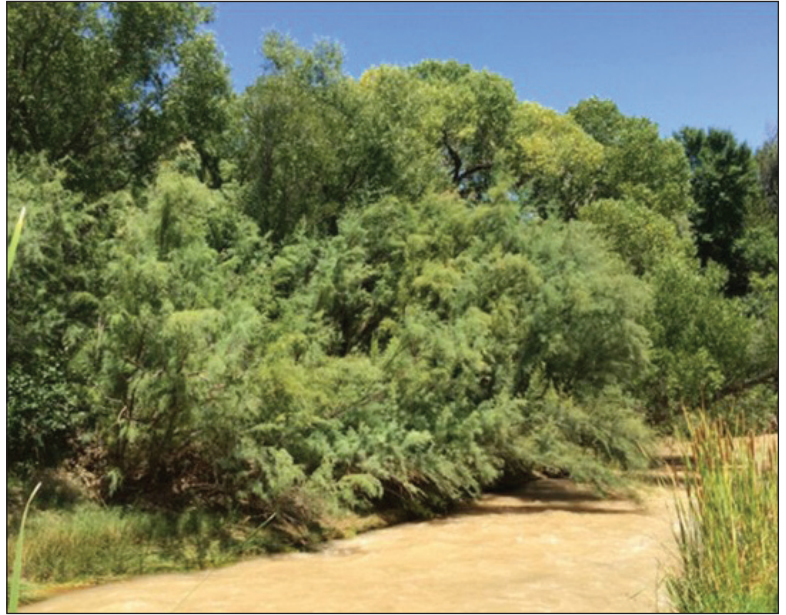
Figure 4: Mixed native/exotic habitat along the Verde River in Arizona; salt cedar in foreground, cottonwood and willow in the background.

USDA Natural Resources Conservation Service (NRCS) Plant Materials Program native plant selections that may be applicable for southwestern willow flycatcher habitat restoration are listed in table 2. This list is specific to Plant Materials Program selections and is not all inclusive of desirable species for flycatcher habitat restoration. Rather, the selections listed have proven traits that increase the probability of successful establishment in their area of adaptation. Many of the grasses in table 2 are typically available from suppliers specializing in native plants. The availability of the tree and shrub species in table 2 is currently very limited with only a few specialized growers producing some of these woody plants.