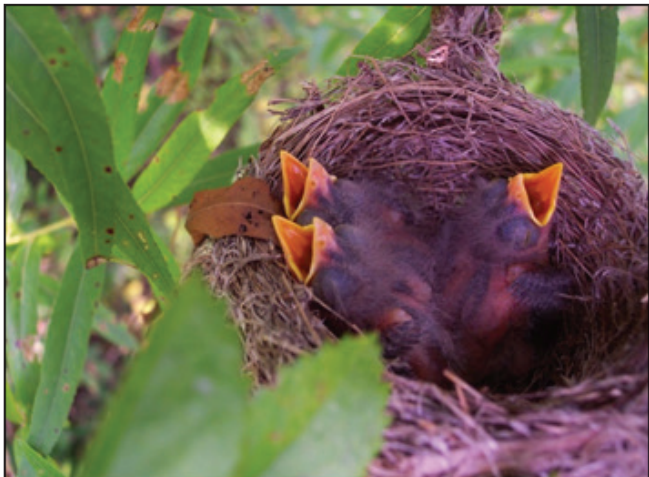
Figure 8: Willow flycatcher nest with chicks.