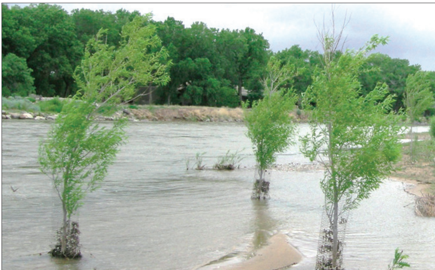
Figure 9: Goodding's willow pole plantings protected by tree guards.

In some parts of the Southwest, tamarisk beetles are defoliating stands of tamarisk and decreasing available habitat for the willow flycatcher. In mixed native/exotic habitats, the native vegetation may re-establish without additional inputs if historic flooding patterns are still occurring or if they can be re-established. In monotypic exotic habitats, extensive efforts at restoration may be required to prevent the former tamarisk habitat being replaced by native or exotic forbs and grasses rather than the trees and shrubs the willow flycatcher needs.