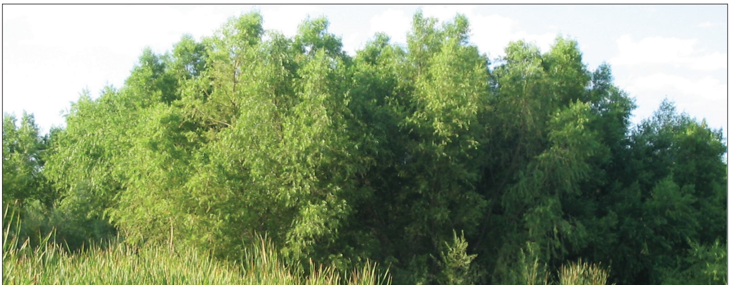
Figure 5: Southwestern Willow Flycatcher Habitat on the lower Rio Grande at Elephant Butte Reservoir in NM.