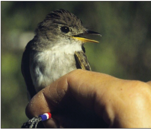
Figure 1: Willow flycatcher in hand - color band RWB – Arizona.