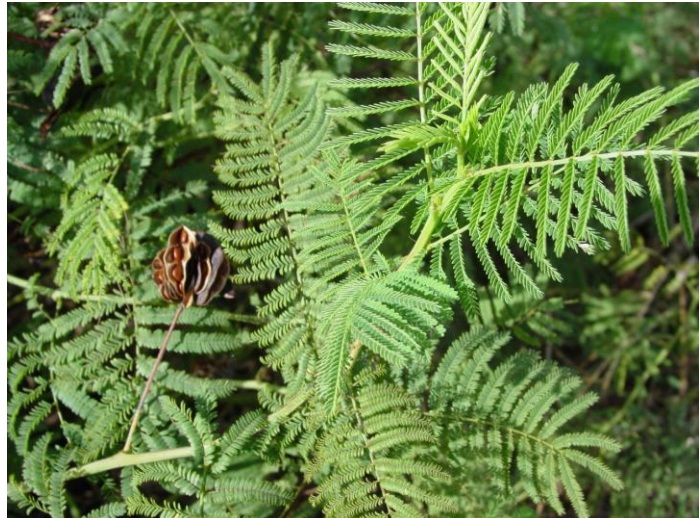
Gary Fine, Bayou Lands RCD

The U.S. Department of Agriculture (USDA) prohibits discrimination in all its programs and activities on the basis of race, color, national origin, age, disability, and where applicable, sex, marital status, familial status, parental status, religion, sexual orientation, genetic information, political beliefs, reprisal, or because all or part of an individual's income is derived from any public assistance program. (Not all prohibited bases apply to all programs.) Persons with disabilities who require alternative means for communication of program information (Braille, Large print, audiotope, etc.) should contact USDA's Target Center at 202-720-2600 (voice and TDD).