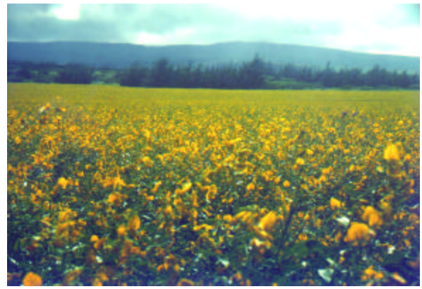
'Tropic Sun' seed production field in full bloom.