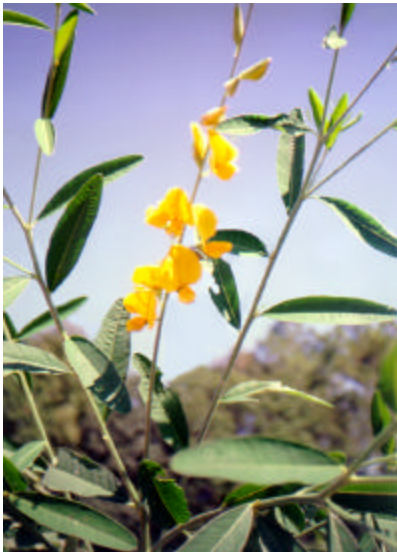
'Tropic Sun' Sunn hemp Bloom