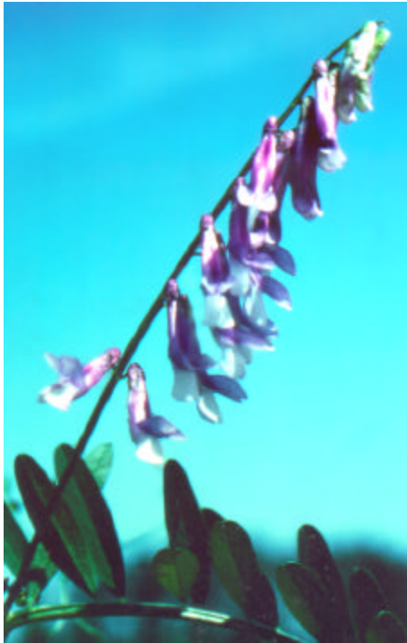
'Americus' hairy vetch Bloom

Jointly released with the University of Georgia, this plant provides excellent winter cover, produces organic matter and nitrogen for summer crops, and is recommended for use in conservation tillage.