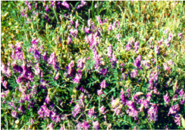
'AU Early Cover' Bloom Vicia villosa

In 1994 an early maturing hairy vetch called 'AU Early Cover' hairy vetch was released by Jimmy Carter Plant Materials Center and Auburn University for conservation tillage.