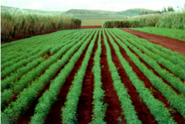
'Tropic Sun' Sunn Hemp seed production field.