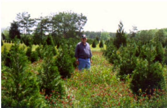
AU-Robin crimson clover used as a cover crop for erosion control and weed suppression in Christmas Tree production fields in Barnesville, Georgia.