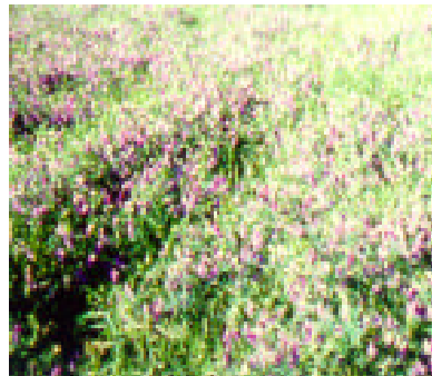
'AU Early Cover' Bloom Vicia villosa Production

In 1994 an early maturing hairy vetch called 'AU Early Cover' hairy vetch was released by Jimmy Carter Plant Materials Center and Auburn University for conservation tillage.