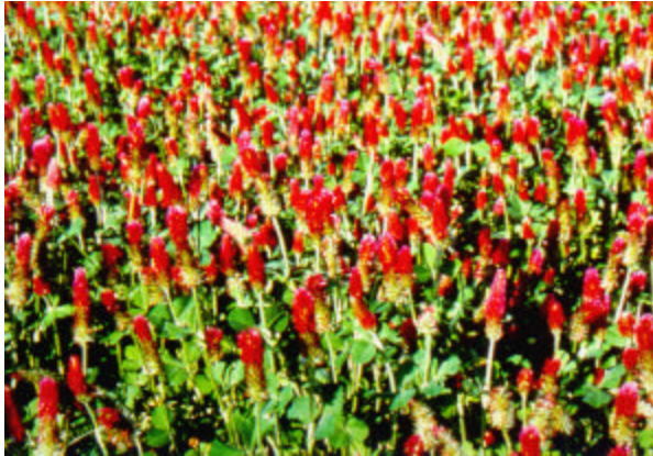
'AU Sunrise' Bloom

An early blooming crimson clover was released by Jimmy Carter PMC and Auburn University in 1997. The latest cover crop release is called 'AU Sunrise' crimson clover. This new crimson clover blooms earlier than any other crimson clover on the market.