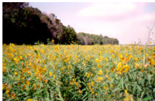
Tropic Sun' Sunn Production Field