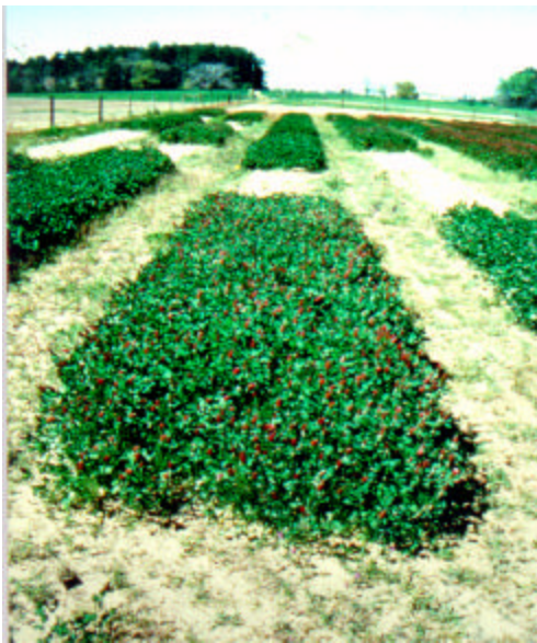
'AU Sunrise' Evaluation

An early blooming crimson clover was released by Jimmy Carter PMC and Auburn University in 1997. The latest cover crop release is called 'AU Sunrise' crimson clover. This new crimson clover blooms earlier than any other crimson clover on the market.