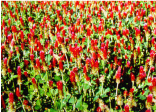
AU-Sunrise for conservation tillage systems. Blooms and matures. Earlier than any crimson clover on the commercial market.