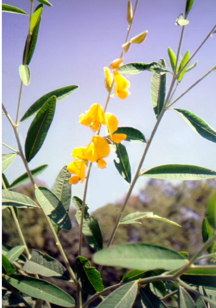
'TROPIC SUN' SUNN HEMP