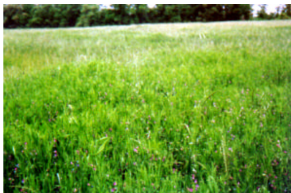
'AU Groundcover' Production Field