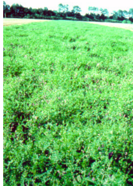
'Americus' hairy vetch seed Production Field

Jointly released with the University of Georgia, this plant provides excellent winter cover, produces organic matter and nitrogen for summer crops, and is recommended for use in conservation tillage.