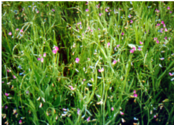
'AU Ground Cover' Caley Pea Lathyrus hirsutus