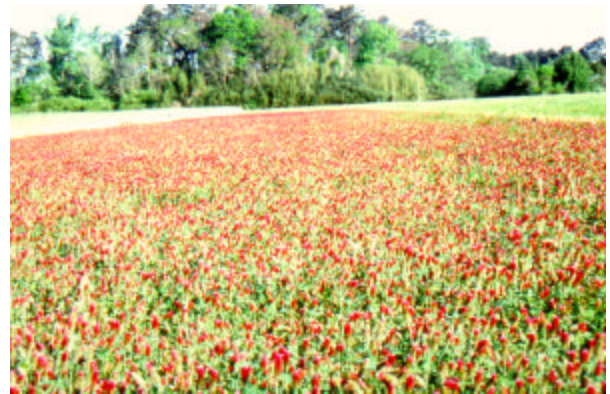
'AU Sunrise' Seed Production Field