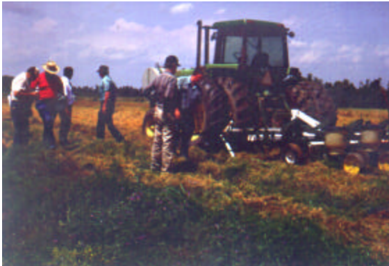
Americus hairy vetch used as a cover crop for conservation tillage.