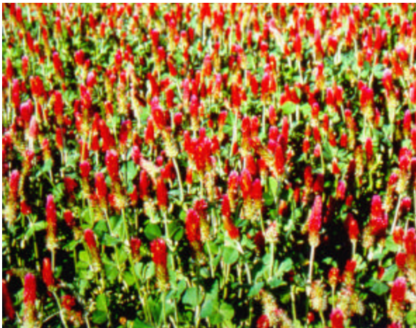
'AU SUNRISE' CRIMSON CLOVER