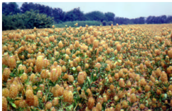
'AMCLO' ARROWLEAF CLOVER