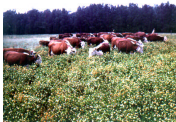
'Amclo' arrowleaf clover can improve the quality of warm season perennial grasses such as, bahia grass when interseeded in the fall. It can provide winter grazing when the warm season grasses are dormant.