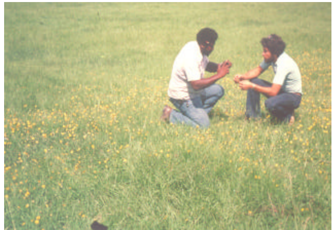
'FLORIGRAZE' PERENNIAL PEANUT