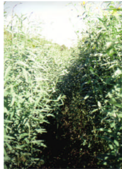
'Tropic Sun' Sunn Seed Production Field 5 feet tall at 80 days old