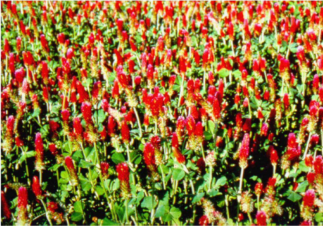
'AU SUNRISE' CRIMSON CLOVER Trifolium incarnatum