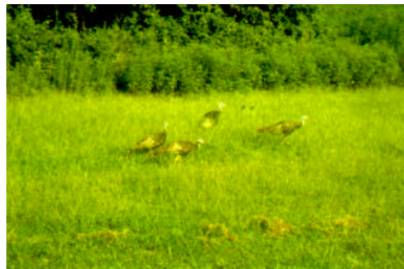
Wild turkeys range over a wide area. Winter annuals are good choices for food plots.