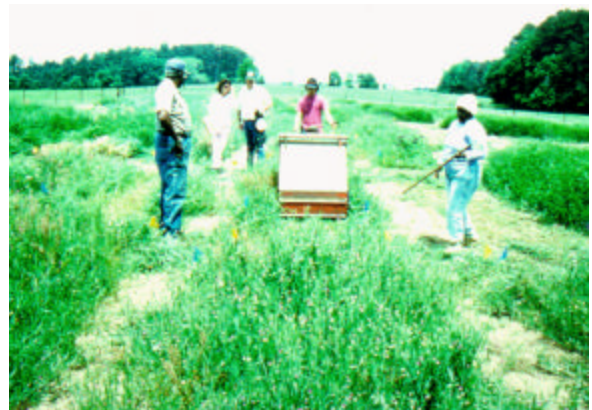
'AU Ground Cover' Evaluation Plots