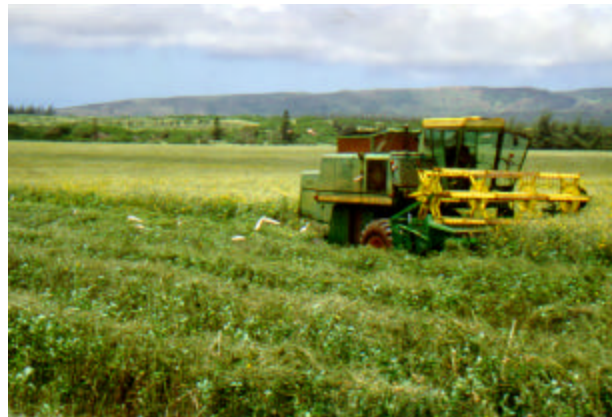
Harvesting Sunn Hemp Seed in Hawaii.