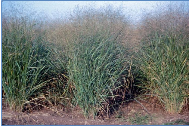
'Shelter' switchgrass seed production field, in full bloom.

A Conservation Plant Release by USDA NRCS Big Flats Plant Materials Center, Corning, New York