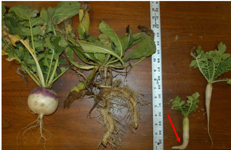
Photo showing tillage cover crops that can help reduce compaction including (from left to right) purple top turnip, forage chicory, and tillage radish (planted late fall). The red arrow indicates the minimizing effect severe soil compaction can have on subsoiling cover crops. This tillage radish was ineffective at soil compaction >300 psi.

For more information, contact: NJPMC, (609) 465-5901