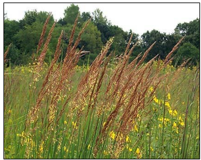
Coastal Germplasm Indiangrass (Sorghastrum nutans L.) is a sourceidentified plant release.

Coastal Germplasm Indiangrass is a source-identified germplasm released by the Cape May Plant Materials Center, Cape May NJ, in 2007.