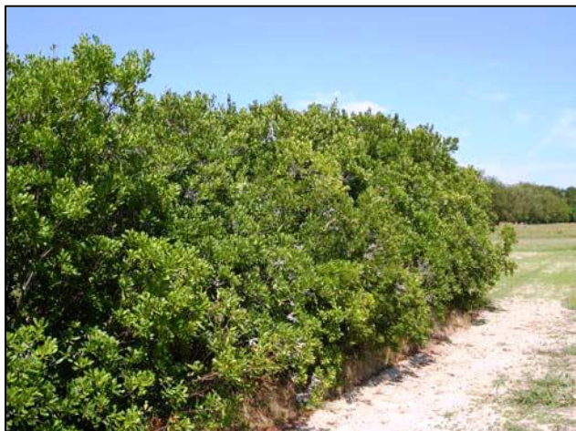
'Wildwood' bayberry ( Morella pensylvanica (Mirbel.) Kartesz) is a cultivar released in 1992.

'Wildwood' bayberry is a cultivar released by the Cape May Plant Materials Center, Cape May NJ in 1992.