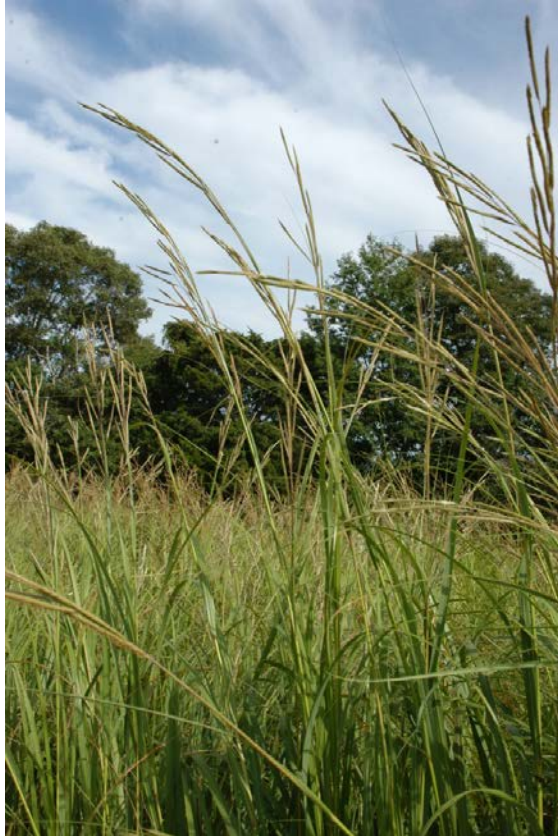
Southampton Germplasm prairie cordgrass is a selected class conservation plant released in 2013.

A Conservation Plant Release by USDA NRCS Cape May Plant Materials Center, Cape May, NJ