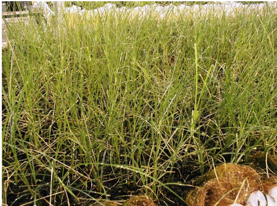
Figure 3. Top - Single Miscanthus sinensis sod strip 6 months after planting. Bottom - Miscanthus sinensis sod strips growing on greenhouse table 6 months after planting.