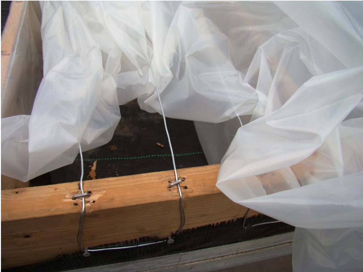
Figure 1. Metal wire stretched across wooden frame with plastic sheet draped over the wires creating a “pocket” which will receive a coir fabric and planting media.