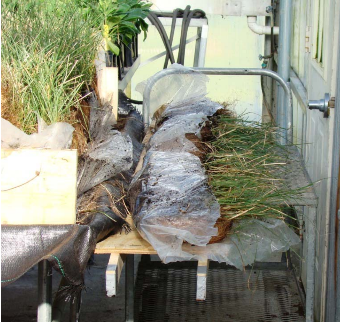
Figure 4. Miscanthus sinensis sod strip, with plastic layer, removed from growing frame on greenhouse table.