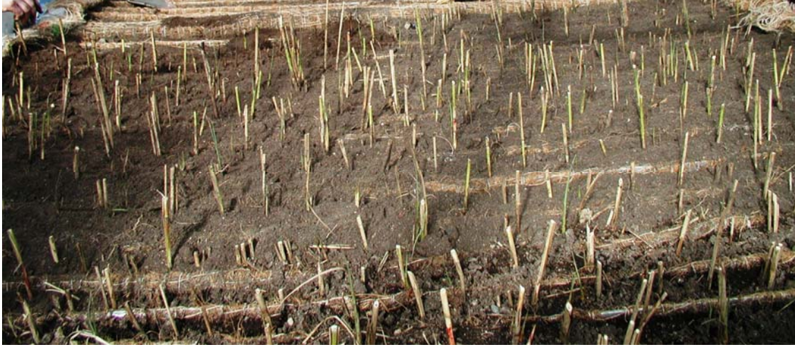
Figure 2. Miscanthus sinensis vegetative material planted at 3 inch intervals within each vegetative sod strip pocket. Growing point positioned below media surface. Stem material from previous growing season visible.