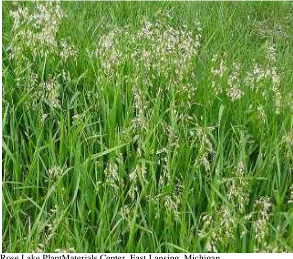
Rose Lake PlantMaterials Center, East Lansing, Michigan

As sweetgrass is not drought tolerant, soil should be kept moist but not saturated. Fertilizer should be applied as appropriate for cool season grasses according to soil test recommendations.