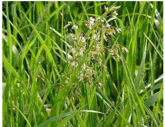
Rose Lake Plant Materials Center, East Lansing, Michigan

Contributed by: USDA-NRCS Rose Lake Plant Materials Center