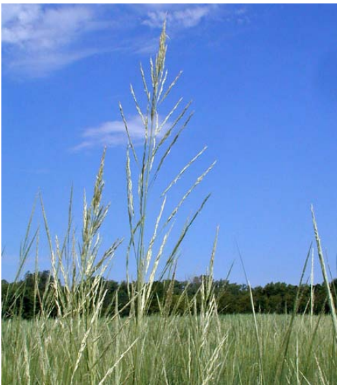
Kansas Wildflowers and Grasses

Contributed by: USDA NRCS Bismarck, North Dakota and Manhattan, Kansas Plant Materials Centers PM Program