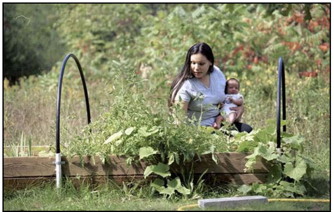
Hoop House in use on the Bad River Indian Reservation in Odanah. WI.

Hoop Houses are small, semi-portable structures that can be used as a small greenhouse structure for starting seedlings and for growing heat-loving vegetables. A hoop house provides frost protection, limited insect protection, and season extension. Hoop house structures are easily constructed and will last many years. Hoop house dimensions can be adjusted to personal needs, but a structure 4 feet x 10 feet is recommended. These dimensions allow easy side access for weeding and allow adequate hoop arch strength relative to span. Cost of this structure is modest. A 4 foot x 10 foot Hoophouse with soil fill can be constructed for approximately $150-$200.