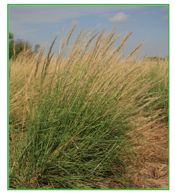
Germplasm Pink Pappusgrass Pappophorum bicolor E. Fourn.