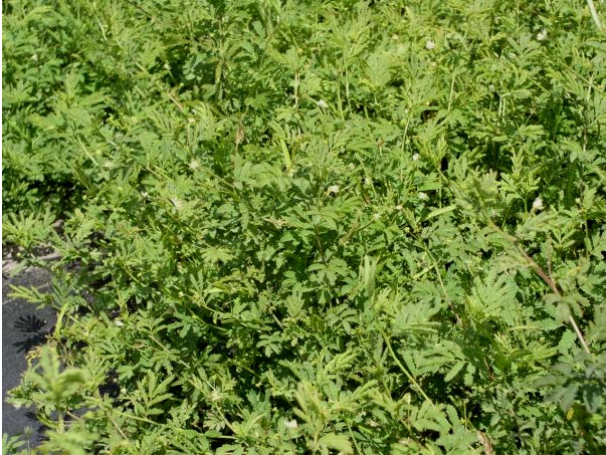
Balli Germplasm prostrate bundleflower.

A Conservation Plant Release by USDA NRCS E. "Kika" de la Garza Plant Materials Center, Kingsville, TX