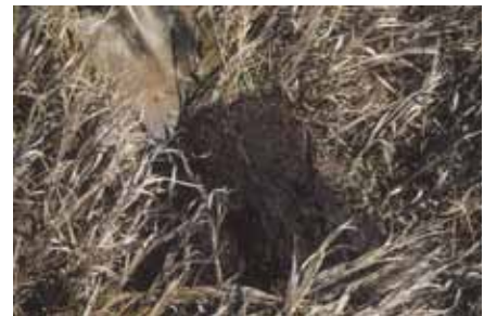
Do not seed into heavy duff or litter layers.