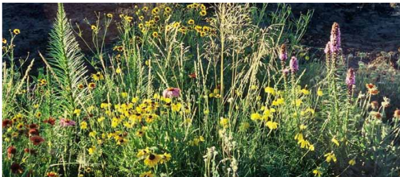
Grass helps support the flowers and creates a more natural plant community.