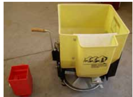
Hand broadcast spreaders work well in small areas.