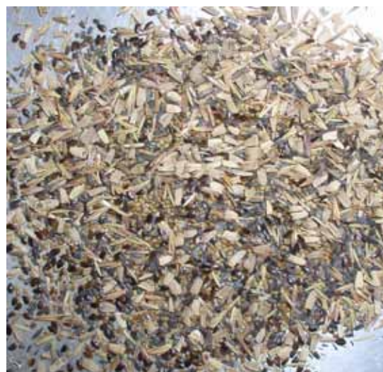
Typical seed mix with 25% grass