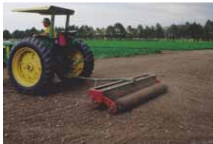
Seed should be pressed firmly in the ground after broadcast seeding.