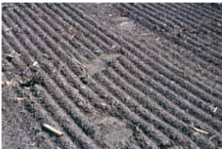
A firm seedbed is required for small seed.

A weedy plot should not be planted. Control weeds by herbicides or tillage before planting. Consider a year of weed control before seeding if the plot has an existing grass cover such as smooth brome grass or quackgrass. There are very few herbicides that can control broadleaf weeds or perennial grasses in pollinator plots after they are seeded. Plots should be prepared with a minimum of residual cover and have a firm, smooth surface. Adult footprints should be hardly visible. If the area is to be broadcast seeded, there must be enough loose soil on the top to cover most of the seed before the packing operation. Program requirements may dictate seeding methods.