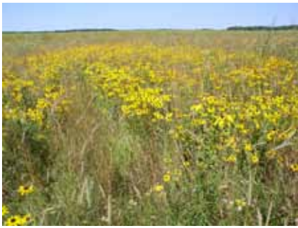
Black-eyed susan is a small seed that can settle to the bottom in the large drill box.