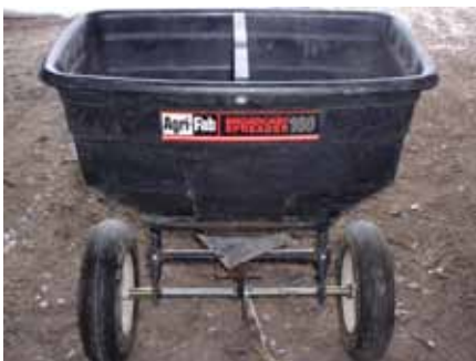
Various broadcast spreaders are available.

Small areas of less than 5 acres can be established by broadcasting the seed. The site should have low residue and preferably tilled for maximum seed to soil contact. Do not broadcast seed on existing duff or litter layers. Wheel-driven or hand operated whirly-bird broadcast seeders work well. Wheel-driven spreaders can be pulled with a garden tractor or ATV. Carriers can be mixed with the seed when broadcasting small amounts. Try to match the size of the carrier to the size of the seed. Chick starter grit is a good choice for smaller-sized seed mixes. Cracked corn works well with larger-sized seed mixes. A ratio of 3:1 and a travel speed of 4 to 5 MPH is a good starting point. Be sure to overlap applications and avoid skip areas that can become weed problems. Remember that different sizes and densities of seed will be spread different distances. Drop spreaders (fertilizer spreaders) are also available. Care must be taken so the seed does not bridge in the spreader. After seeding, the field may be lightly harrowed (chain link fence) to cover the seed and smooth the field. Spike or spring-tooth harrows often bury the seed too deep, unless set flat to the ground. Finally, the planting must be packed with the seed firmly pressed into the ground. If a packer is not available, tractors with dual tires or drills with packer wheels can be used.