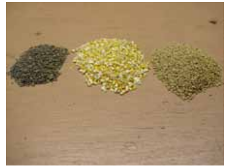
Various carriers (clay oil absorbent, cracked corn, and chick starter) can be mixed with the seed.

Larger areas to be seeded with a higher volume of seed may be planted through the wheatgrass (small grain) box on a drill. This is the back box, and it usually has an agitator to keep the seed well mixed. This box does not work well with smaller quantities of seed because it does not have separate compartments for each row. Cardboard dividers can be added to help keep seed distributed over the feed cup. Seed needs to be monitored frequently to ensure that seed cups are full and agitators are properly mixing the seed. Caution: Never put your hand in the seed box of an operating drill. Smaller, heavier seed tends to fall to the bottom of this box and should be seeded only through the legume box. Another technique would be to spread a handful of seed in front of the drill as you are seeding, or mix a small amount in the box every round or two. The seed should be spread as uniformly as possible over most of the field. Carriers can be mixed with the seed to help in calibration.