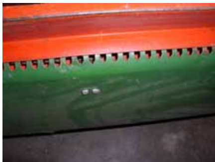
Drop spreaders have adjustable plates over the seed opening.