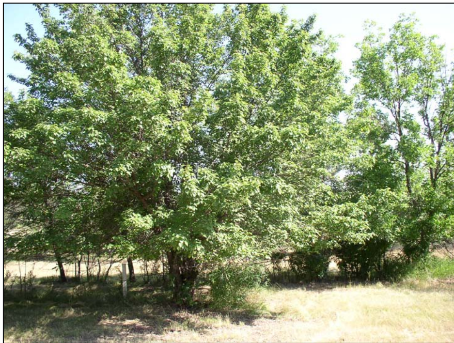
'McDermand' Ussurian pear at the Sweet Briar Recreation Area

This site has been well maintained by the Morton County Park Board. Many of the tree and shrub accessions have continued to flourish. Accessions that continue to perform well through 2008 are ND-674 bur oak, ND-1030 buckeye, ND-686 Pekin lilac, 'McDermand' Ussurian pear, and several accessions of hackberry.