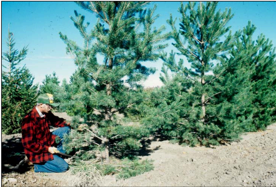
Williston Off-Center Evaluation Planting in 1988

The soil type is a Williams loam. The Williams series consists of deep, well-drained, moderately slow or slowly permeable soils formed in calcareous glacial drift on uplands. This soil is in Windbreak Suitability Group 3. If moisture is conserved, these soils are well suited to all types of windbreak and other plantings.