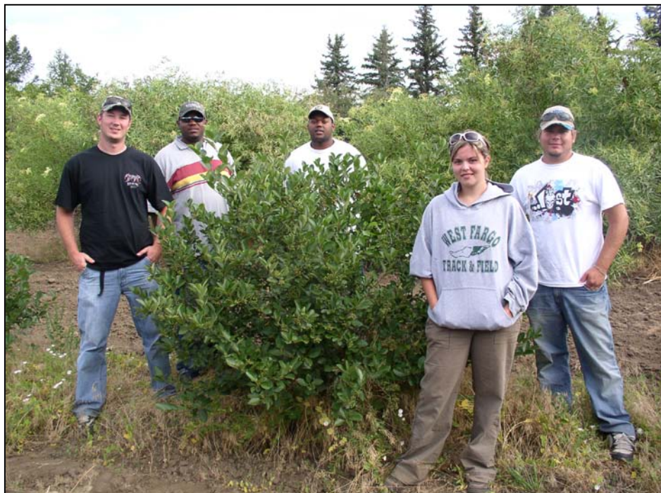
'McKenzie' black chokeberry at Dickinson with NRCS student employees

The soil type at the site is a Parshall sandy loam. The Parshall series consists of deep, well-drained soils formed in fine sandy loam alluvium on terraces and outwash plains and in upland swales. This soil is in North Dakota Windbreak Suitability Group 5. Erosion hazard is serious. In the dry years of 1990 and 1991, a cover crop was maintained to prevent soil erosion.