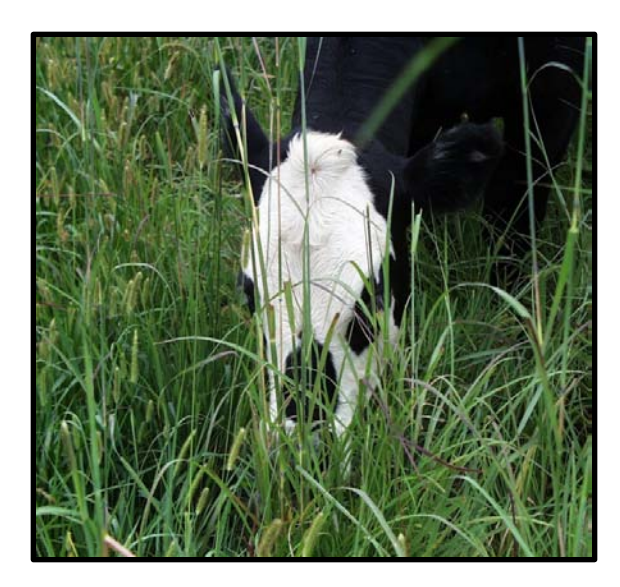
Cow grazing OZ-70 Germplasm big bluestem

For more information, contact: USDA-NRCS Elsberry Plant Materials Center, 2808 North Highway #79. Phone # 573-898-2012, Fax# 573-898-5019, website: <a href="http://plant-materials.nrcs.usda.gov">http://plant-materials.nrcs.usda.gov</a>