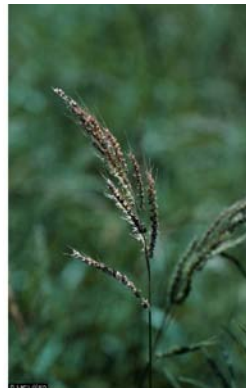
USDA NRCS. Wetland flora: Field office illustrated guide to plant species

The U.S. Department of Agriculture (USDA) prohibits discrimination in all its programs and activities on the basis of race, color, national origin, age, disability, and where applicable, sex, marital status, familial status, parental status, religion, sexual orientation, genetic information, political beliefs, reprisal, or because all or part of an individual's income is derived from any public assistance program. (Not all prohibited bases apply to all programs.) Persons with disabilities who require alternative means for communication of program information (Braille, Large print, audiotape, etc.) should contact USDA's Target Center at 202-720-2600 (voice and TDD).