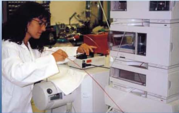
Sample extracts are prepared for loading into autosampler for analysis by high-performance liquid chromatography.

provides new chemical-methods development and transition into the NWQL's capabilities, methods improvement, custom methods, and specialized support for NWQL Analytical Services and USGS national programs. Results of MRDP's method development and other research activities are presented at professional meetings, in scientific journals, USGS publica-