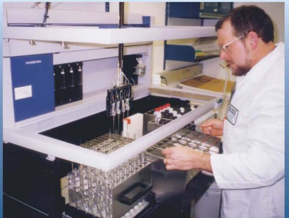
Robotic liquid sample-handling system is configured for automatic, simultaneous preparation of digests for dissolved Kjeldahl nitrogen and dissolved low-level phosphorus determinations.

interlaboratory and certification programs administered by third-party agencies. The NWQL takes part in national and international performance evaluation studies coordinated by the following organizations: Environment Canada, National Environmental Laboratory Accreditation Program, National