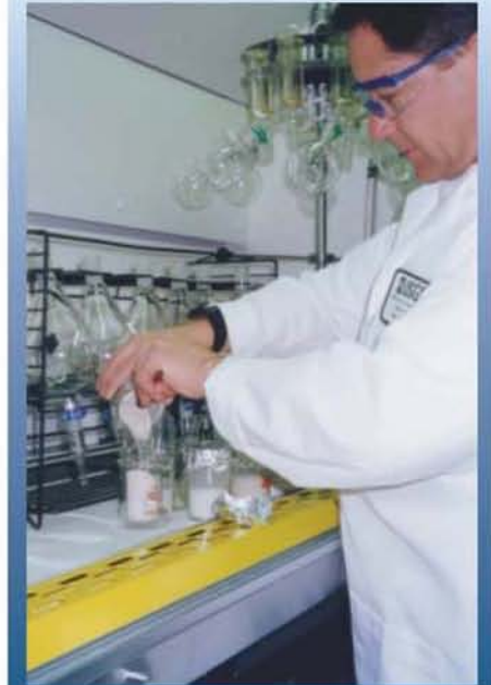
Fish-tissue samples are prepared for Soxhlet extraction.

Performance Evaluation. The NWQL demonstrates exceptional performance in testing for a wide range of constituents in various sample matrices by participating in