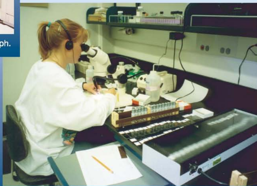
Biological technician prepares slides of invertebrates for identification.

The USEPA has supported a National Environmental Laboratory Accreditation Program (NELAP) since the early 1990s to promote national standards for quality procedures that relate to laboratory certification. These standards apply to