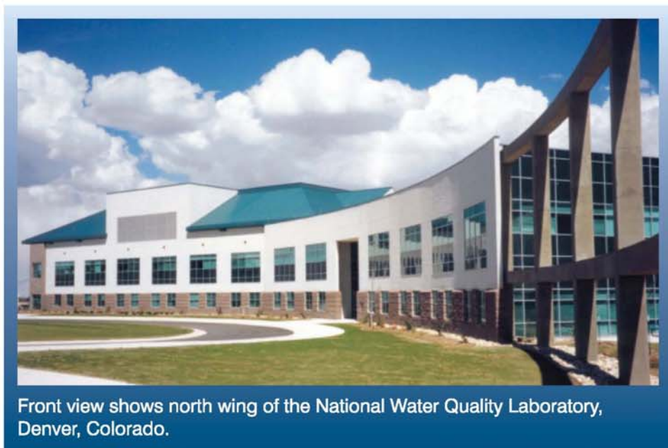
Front view shows north wing of the National Water Quality Laboratory, Denver, Colorado.

The NWQL has a highly trained and talented work force, and a history of quality and leadership in development of analytical methods for water, sediment, and tissue. The NWQL offers comprehensive services through a modern facility designed for efficient and safe operation. It was moved into a new building in spring