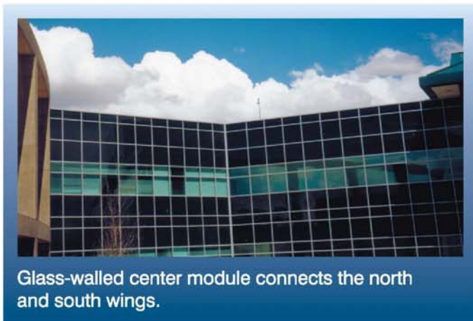
Glass-walled center module connects the north and south wings.

"ultratrace" concentrations require methods of analysis that, in some instances, are more stringent than that required for many present standards of water quality and include compounds that are not available from any standard analysis. Detections of even trace amounts of compounds can be important when classifying or