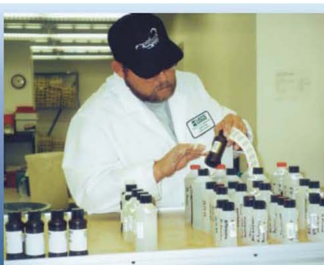
Sample login area is conveniently located near shipping and receiving. Samples are unpacked and bar-code labels are applied for identification and tracking.

each year from these samples through agreements with USGS offices relating to national assessment and cooperative programs with other Federal, State, and local agencies. Analytical work destined for the NWQL flows through these USGS offices throughout the United States.