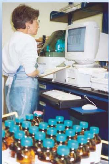
Dissolved organic carbon samples are analyzed on an ultraviolet persulfate total organic carbon analyzer.

The high volume of analyses, accuracy and reliability, low-detection levels, and new applied research mark the NWQL as a unique part of the USGS. At present (2001), about 60,000 samples collected with USGS field protocols are sent to the NWQL each year, making it one of the largest environmental water-testing laboratories in the United States. More than 2.3 million individual chemical determinations are made