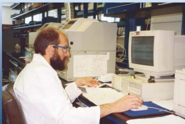
Chemist analyzes data from liquid chromatograph.

Consistency. Validating the consistency of analytical data nationwide is one goal of the NWQL's participation in the NELAP process. Consistent data lend credence to the data for all samples, whether collected as one-time “grab” samples or gathered as multiple samples and analyzed over years for