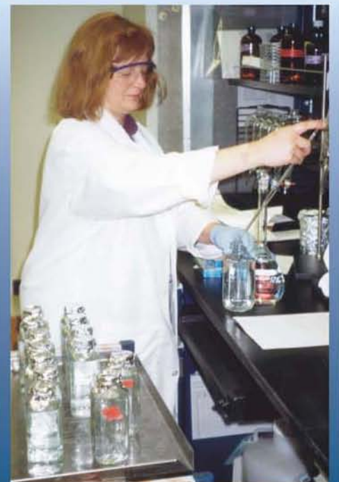
A spike is pipetted into a distilled water sample in the carbon lab.

Inorganic Chemistry. Selected major anions and cations, metals, nutrients, and physical properties are determined in water, sediment, and tissue samples. Examples of physical properties include color, pH, specific conductance, and turbidity. Instrumentation includes