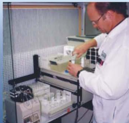
Samples of inorganic trace elements are prepared for analysis by inductively coupled plasma-mass spectrometry.

custom methods and offer analytical design consulting. Current research is focusing on emerging national water-quality issues, the need for even lower detection levels than those already in use, identification of new compounds, and improvement in accuracy (low bias and low variability) for present methods. Recent new methods, for example, have been developed to determine polar pesticides and pesticide degradates (compounds that are breakdown products from the original pesticide) in surface- and ground-water samples at concentrations as low as 0.002 microgram per liter.