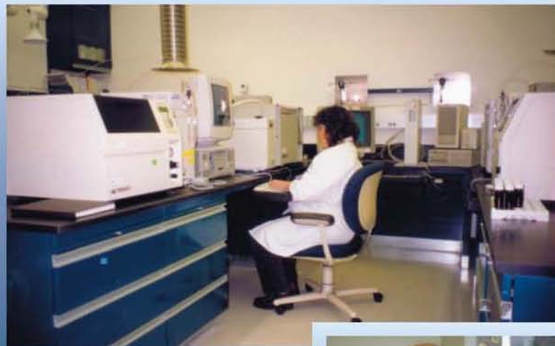
Gas chromatographic mass spectrometer is set up for determining presence and concentrations of volatile organic compounds.

Analytical Services. The NWQL determines organic and inorganic constituents in samples of ground and surface water, river and lake sediment, aquatic plant and animal tissues, and atmospheric precipitation collected in the United States and its protectorates. The NWQL determines about 600 unique constituents in multiple matrices; the majority of these determinations are made from water samples. These analytical determinations are used in the interpretation of hydrological and chemical data to provide an inte-