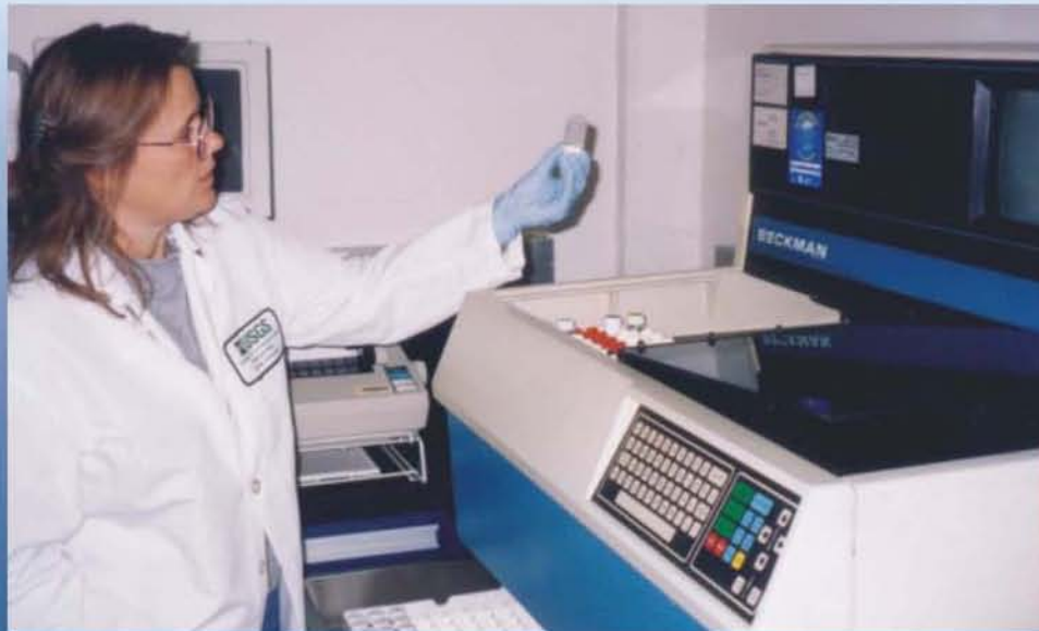
Sample vials of ambient water in a scintillation cocktail are loaded into a liquid scintillation system for radon detection.

One new method determines wastewater compounds in response to concerns over the effects of endocrine-disrupting chemicals on aquatic organisms. Selected compounds that are identified include food additives, fragrances, antioxidants, flame retardants, plasticizers, industrial solvents, disinfectants, fecal sterols, polycyclic aromatic hydrocarbons, and high-use domestic pesticides. In another new method, the first unequivocal confirmation of the presence of benzalkonium chloride (an active ingredient in cleaning and disinfection products) in water samples provides a useful tool in the trace-level monitoring of wastewater samples.