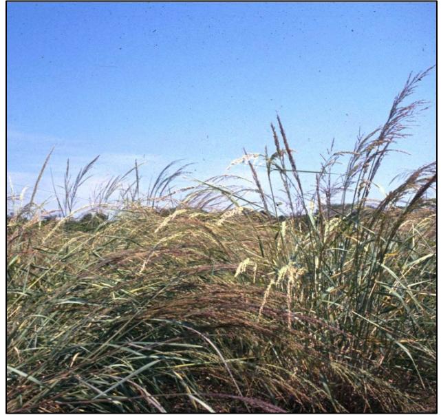
'Atlantic' coastal panicgrass (Panicum amarum Ell. var. amarulum) is a cultivar released in 1981.

Panicum amarum Ell. var. amarulum (A.S. Hitchc. & Chase) P.G. Palmer