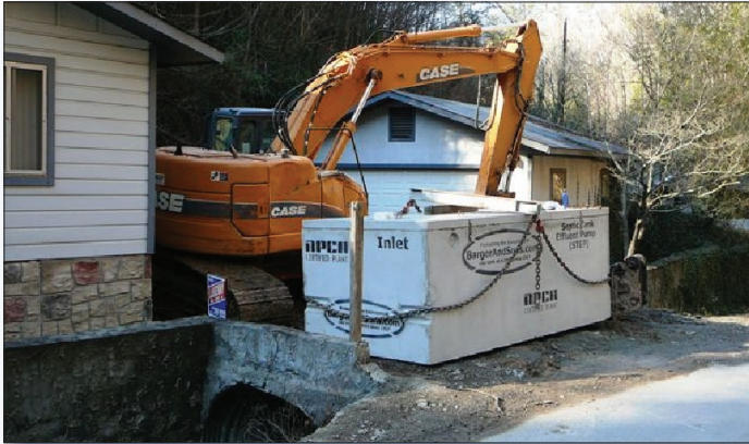
Figure 2. Maneuvering the new STEP system equipment into place was challenging because of tight working conditions along King Branch Road.

geometric mean based on a minimum of 10 samples collected from a given sampling site over a period of not more than 30 consecutive days, with individual samples being collected at intervals of not less than 12 hours; and, the concentration of the fecal coliform group in any individual sample shall not exceed 1,000 cfu/100 mL.