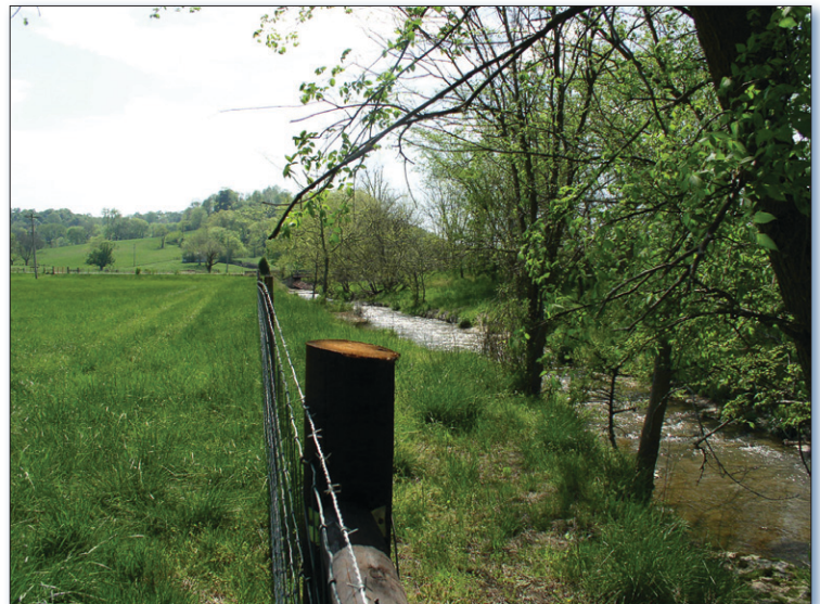
Figure 1. Landowners built fences to exclude livestock and establish a riparian zone along Kyker Branch.

Local landowners installed agricultural BMPs in the Kyker Branch watershed using grants from both the CWA section 319 program and Tennessee's Agricultural Resources Conservation Fund. With help from the Greene County Soil Conservation District, farmers installed 16,478 feet of fencing that excludes cattle from the branch (Figure 1), added three alternative watering facilities, built 1,200 feet of pipeline that carries water to new alternative watering facilities, and protected 0.1-acre of heavy-use area.