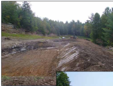
Figure 2. Gollieher Creek site, excavated cell, October 2008.