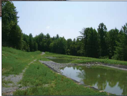
Figure 3. Gollieher Creek site, post- reclamation, August 2009.

also involved constructing AMD treatment systems and reclaiming abandoned coal mines to improve the water quality in Mill, Gollieher, and Little Laurel Creeks (the three tributaries to Crab Orchard Creek). Four abandoned mine sites where AMD was significantly impacting receiving streams were prioritized and included approximately 185 acres of abandoned surface mines with two sediment ponds, 1,500 feet of highwalls, six identified seeps, and approximately 2,000 feet of exposed and eroding creek bank.