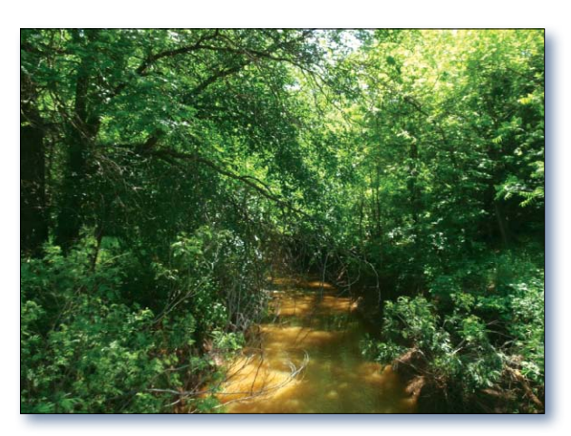
Figure 1. Turkey Creek flows through Woods County in western Oklahoma.

Landowners implemented BMPs with assistance from Oklahoma's locally led cost-share program and through the local Natural Resources Conservation service (NRCS) Environmental Quality Incentives Program, Conservation Stewardship Program, Wildlife Habitat Incentive