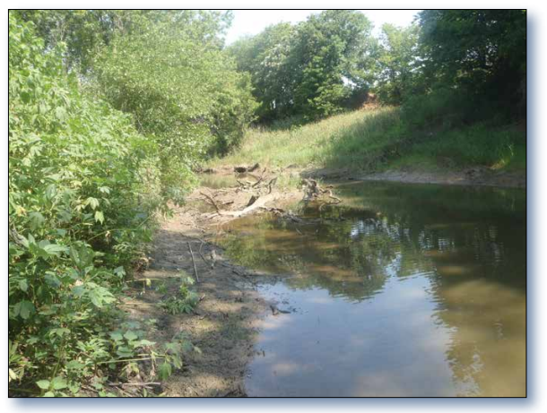
Figure 2. Water quality improved in Oklahoma's Bitter Creek after landowners implemented BMPs.

The improvement in water quality in Bitter Creek was documented by OCC's statewide nonpoint source ambient monitoring program. The OCC's Rotating Basin Monitoring Program is supported by U.S. Environmental Protection Agency CWA section 319 funding at an average annual cost of $1 million. Monitoring costs include personnel, supplies, and lab analyses for 18 parameters from samples collected every 5 weeks at about 100 sites for a total of 20 episodes per 5-year cycle. In-stream habitat, fish, and macroinvertebrate samples are also collected. Statewide educational efforts through Blue Thumb are also funded by CWA section 319 at a