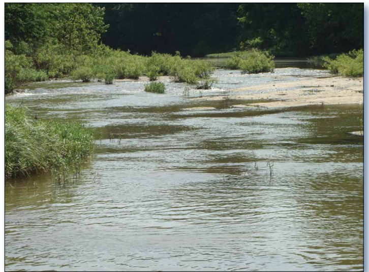
Figure 3. Oklahoma's Big Creek after restoration.

100 sites, as well as trainings and other outreach activities. The Oklahoma cost-share program provided $10,073 in state funding for BMPs in this watershed through the Nowata County and Craig county conservation districts, and landowners contributed $6,012 through this program. NRCS spent approximately $1,863,150 for implementation of BMPs in the area from 2008 through 2011.