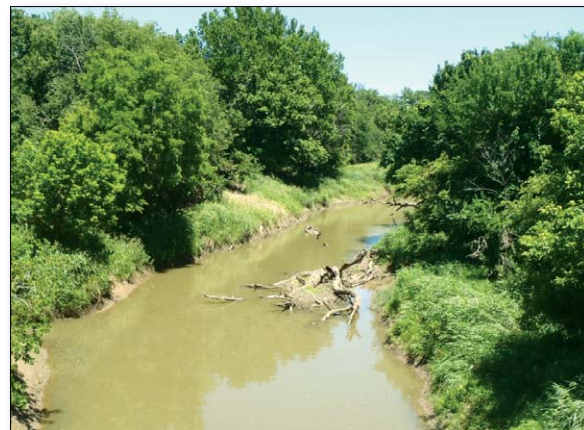
Figure 1. Oklahoma's Beaver Creek flows through Osage County.

Landowners implemented BMPs with assistance from Oklahoma's locally led cost-share program and through the local Natural Resources Conservation Service (NRCS) Environmental Quality Incentives Program, Conservation Reserve Program, Grassland Reserve Program and general technical