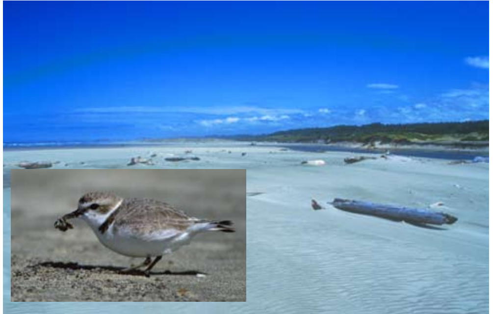
The Oregon Parks and Recreation Department has a habitat conservation plan to support the recovery of the western snowy plover by controlling invasive beach grass; managing predators such as crows, ravens, foxes, coyotes, and raccoons; and shifting activities such as dog-exercising and kite-flying away from the birds and their nests, eggs, and chicks. The Department has a 25-year incidental take permit for occasions when recreation inadvertently harms the threatened species. Western snowy plover photo by David S. Pitkin; habitat photo by Kathleen Castelein, Oregon Biodiversity Information Center.

For endangered species, permits may be issued for scientific research, enhancement of propagation or survival, and taking that is incidental to an otherwise lawful activity.