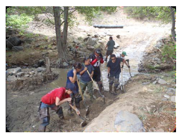
Fish passage crossing construction on the Rio Paguate.