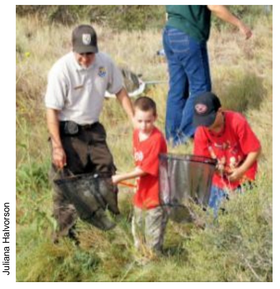
Kids trying to catch a dragonfly with a little help from a FWS employee.

Dexter NFH&TC staff participated in the annual Dragonfly Festival at the Bitter Lakes National Wildlife Refuge. A living stream display was set up with razorback sucker, bonytail, and Colorado pikeminnow for the public to see. Staff described Dexter's program to the visitors and answered questions concerning the Centers activities and mission. An estimated 2,000 to 2,500 people attended.