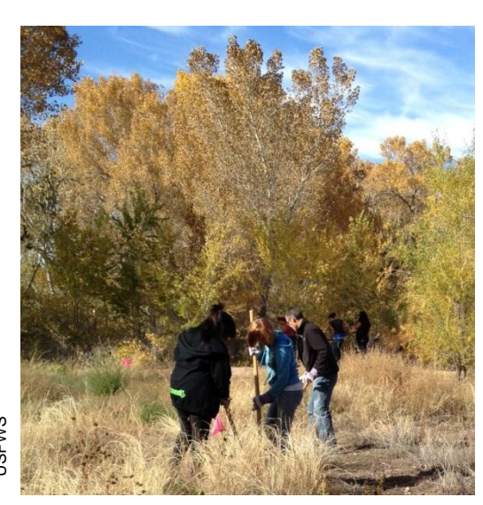
Amy Biehl Charter High School students help with non native plant species removal

NMFWCO and Amy Beihl Charter High School, along with several other partners have teamed up in developing the Rio Grande Silvery Minnow Sanctuary Environmental Education Center located in Albuquerque, New Mexico. October of 2011 was the first sanctuary site visit for the Amy Biehl students, 10 freshman students spent the afternoon removing and learning about invasive non-native vegetation. Students will continue to spend time each month for the 2011-2012 school years at the sanctuary doing site volunteer work. Future duties will include; non-native species removal, sedimentation build up removal, pollinator garden design and planting, cotton wood tree protection against beavers and trail design and construction.