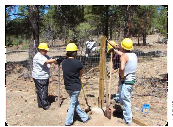
TYCC fixing corral fencing.

The 1st Annual Santa Clara Pueblo Tribal Youth Conservation Corp (TYCC) was sponsored by New Mexico Fish and Wildlife Conservation Office (NMFWCO) and hosted by Santa Clara Pueblo - Office of Environmental Affairs (SCP-OEA). Unfortunately, on June 29, 2011 the Las Conchas Fire altered all field projects scheduled for the Santa Clara Canyon. The Las Conchas Fire had consumed much of the Santa Clara Creek drainage. In preparation of post-fire flooding events, the TYCC crew assisted and participated with SCP-OEA and Pueblo community with the filling of sandbags, and stacking sandbags along barrier walls to protect their homelands.