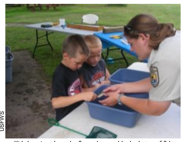
Kids learning about the fins, colors, and body shapes of fish during a BiT course.

Tishomingo NFH staff developed and conducted two new clinics for youth. The first class, "Native Fish ID", focused on proper identification and collection of common native fishes. Children learned to net and seine fish from a display pool then participated in handson activities related to proper fish identification. Hatchery biologists guided kids and participating parents on a tour of the hatchery, followed by activities and games that focused on conservation of aquatic resources. At the end of the course children received BiT completion certificates and stickers.