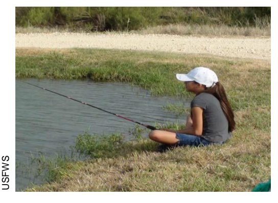
A young girl waiting for the big fish to bite

The Uvalde NFH Annual Fishing Derby is similar to the Fourth of July or Christmas. It's a time for having fun and expecting a big surprise! A few weeks before June, plans were in the works to get one of the ponds ready for kids to come enjoy a few hours at the facility. With them brought hopes of catching the biggest fish ever. The amazement in a child's eyes when they saw their catch at the end of their pole, the smiles, laughter and excitement made it all worthwhile. The importance of protecting our natural resources was emphasized by fishery staff in hopes that the kids fishing today will one day return with their kids and do the same.