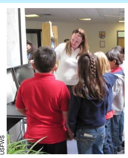
Staff from Dexter NFHTC discuss hatchery and tech center operations with 4th graders from a local school

School tours resumed at the Dexter NFHTC. Groups from Valley Christian Academy, All Saints Catholic School, and Hagerman High School toured the Molecular Ecology, Physiology & Pathobiology, Fish Health labs, and Fish Culture facilities. Information was shared about Dexter's current research, diagnostics, genetics, fish culture, and conservation programs. Students were able to observe many of the species reared at Dexter. After the tour, the Hagerman High School FFA students were interested in learning more about culturing fish and plan to set up a culture system at their school.