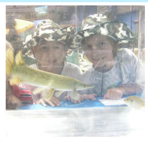
Kids observe a juvenile alligator gar

The Tishomingo NFH set up informational booths for two different annual events in September. Biologists provided outreach materials and information at the Johnston County Fair, located in Tishomingo, OK, and the annual Oklahoma Wildlife EXPO located in Guthrie, north of Oklahoma City. Both events featured a "Kid's Day" which invited all school aged children from local areas to attend. A pictorial display of hatchery projects provided a background for the live alligator snapping turtles display. Another show stopper included a three month old alligator gar that kids and adults loved to watch through aquaria glass. Biologists received many questions about the fish pointing out differences between the alligator gar and the three other native species of gar found in Oklahoma.