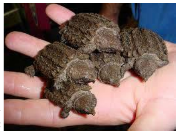
Alligator snapping turtle hatchlings at Tishomingo NFH

The Tishomingo NFH has a new friends group, Friends of the Alligator Snapping Turtle (FAST). The group is comprised of biologists from state agencies and academic institutions in support of the alligator snapping turtle program at the hatchery. FAST has already secured $11,000 in funding from the Delta Foundation. The donated funds will be used to purchase an environmental chamber to expand hatchling production, tracking equipment for research and monitoring, and heat pumps for the alligator snapping turtle recirculation system at the hatchery. Through their contacts throughout the nation, FAST plans to continue searching for donations to support the turtle program at the hatchery by improving research and assessment abilities with the goal of reestablishing and managing this species throughout its range.