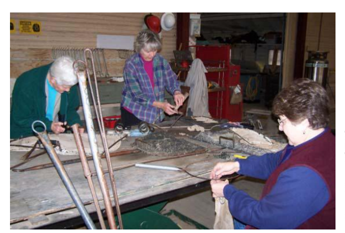
Volunteers help repair holes in seines and other nets, Inks Dam NFH