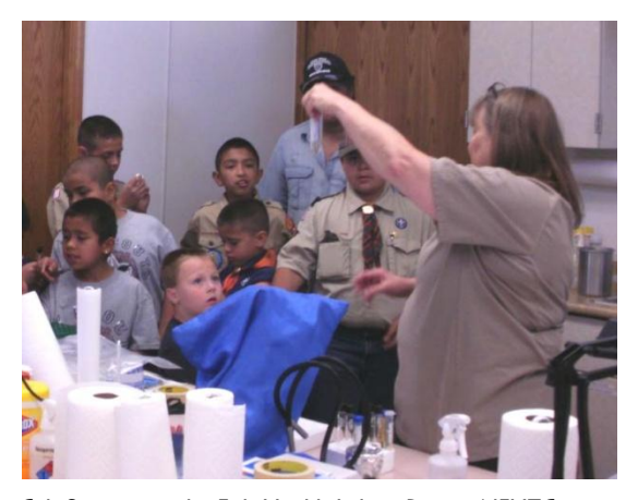
Cub Scouts visit the Fish Health Lab at Dexter NFHTC

While monitoring the health and wellbeing of hatchery and wild fish populations is the primary focus of the work accomplished by Dexter NFHTC Fish Health Center staff. educating the public about the importance of the Service's Fish Health mission is also an important part of the job. Such was the case when Cub Scout Troop #214 came for a visit. The scouts received a tour that focused on fish culture and fish health. In the Fish Health Parasitology laboratory, the troop viewed several species of fish parasites. Troop #214 also observed samples being processed for whirling disease testing. As always, looking at tapeworms was considered the highlight of the fish tour.