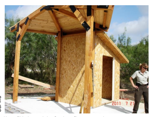
Karin Eldridge and the Outdoor Classroom under construction.

As a complement to the new wildlife pond developed during 2010, Uvalde NFH staff continued construction of a new outdoor education classroom, interpretive trail, bird viewing pier and gazebo that will offer nature lovers and local students another venue to observe the area's abundant wildlife. By the time the trail is complete, Says Grant Webber, it will include benches and tables for picnics for tourists and folks who might be close enough to take a lunch break beside the lake."