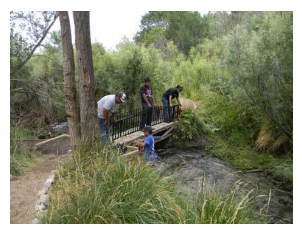
YCC constructed 7-miles of trail between the fish hatchery and the Head start Center.