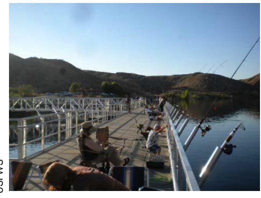
Anglers line up at Lake Mohave's fishing piers to catch rainbow trout stocked by Willow Beach NFH.

Willow Beach NFH stocks 12" rainbow trout into Lake Mohave 52 weeks a year. The trout provide outdoor recreational opportunity for the local and surrounding community, drawing anglers from up to 100 miles away. There has been a significant increase in angling, particularly from families with children, since completion of the Willow Beach Marina Renovation and the Hoover Dam Bypass. Providing an avenue for the public to connect with nature is paramount to supporting conservation and the mission of the U.S. Fish and Wildlife Service.