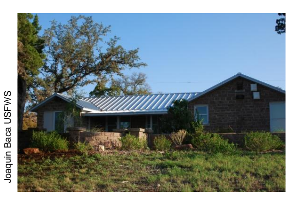
Environmental Education Center

In 2011 renovation of a 70-year old stone cottage, formerly owned by the Lower Colorado River Authority, for an Environmental Education building was completed. The Friends of Inks Dam National Fish Hatchery completed the education building interior renovations and landscaping, donating a total of 934 hours of work. The purpose of the Environmental Education building is to provide interpretive and educational materials and programs that will enhance the visiting public's appreciation of our Nation's fish and wildlife resources and thus encourage the use of the recreational opportunities provided by the hatchery. In 2011, 10,000 youth were reached by over 50 education and outreach events.