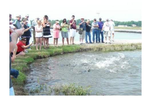
4<sup>th</sup> Grade Class at Murray State Park after completing a course on aquatic ecology.

Tishomingo NFH staff setup educational booths at Murray State Park and the Greater Southwest Historical Museum in Ardmore, OK. The event at Murray State Park reached 150 children from four area schools in OK. Each class of fourth graders spent approximately 25 minutes at the booth while biologists described and answered questions on why and how each species is reared at the hatchery.