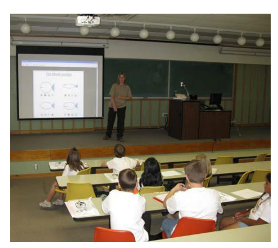
Fourth graders learn about fish anatomy