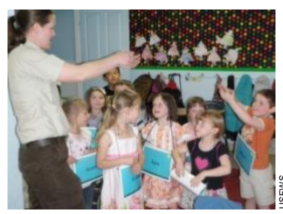
Students learn about fish anatomy by making a fish out of people during a BiT course.

Arizona FWCO staff presented a BiT course to 30 students (grades K-3) at the Successful Beginnings Charter School and to 15 youth at the Sequoia Village School "Panther Pals" After-School Program. The students learned about fish anatomy, assembled a fish out of people, and created their own fish to take home. Staff also presented a BiT course to 120 summer campers (ages 5-12) at the Flagstaff Athletic Club. Students learned about native fish conservation and fish anatomy and morphology. Students went home with many prizes ranging from new fishing poles to native fish bookmarks and stickers.