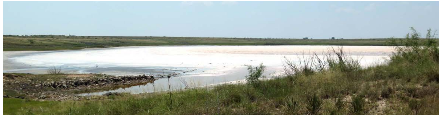
The view of lower Paul's Lake. This and other saline lakes on the Refuge once held water most of the year, but now are dry except after thunderstorms and during the winter. Paul's Lake hosts its largest concentration of lesser sandhill cranes during the winter months, with normal peak observation counts of approximately 96,000 birds annually. A record number of 250,000 cranes used the lake in 1983.

at a time," Smith says. What Brooks demonstrated to him, Smith recalls, was courage—"we were afraid for our lives"—humility, and respect for private property rights. "By the time we were done, people that had been threatening to shoot us were civil and offering us a glass of iced tea," Smith remembers. Five months later, they had permission to access 80 percent of the lands they had been kicked off. He says, "It was then that I realized it wasn't all about the fish—it was also about people and our approach to people."