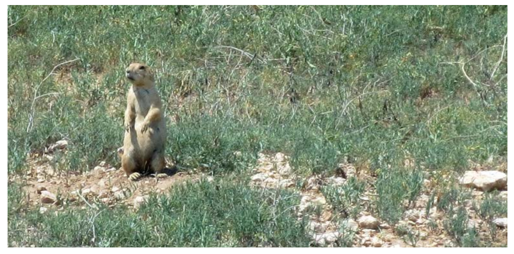
Southwest Region Science Applications 3

Black-tailed prairie dogs are common on Muleshoe Refuge. The Refuge manages for expansion of prairie dog colonies on the Refuge through prescribed grazing and fire.