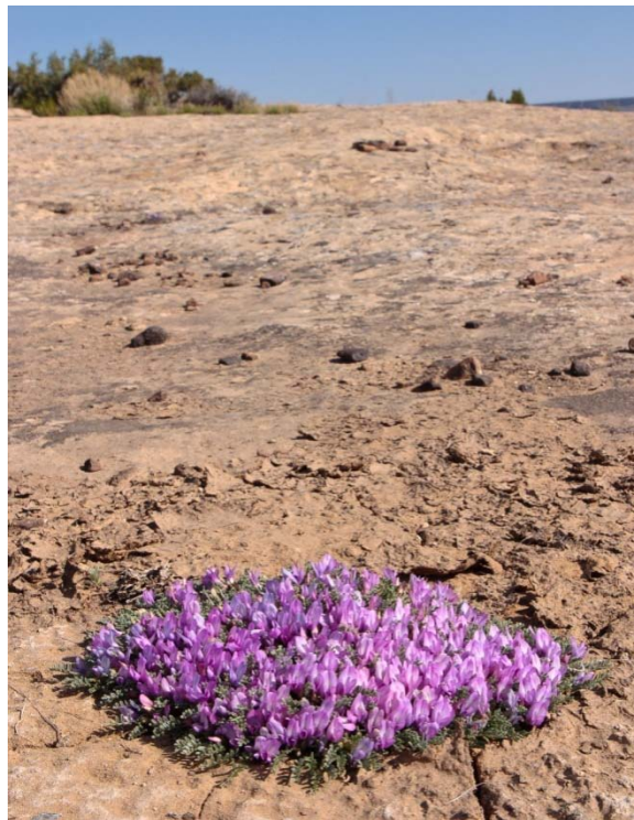
Figure 3: Mancos milkvetch ( Astragalus humillimus ) habitat.