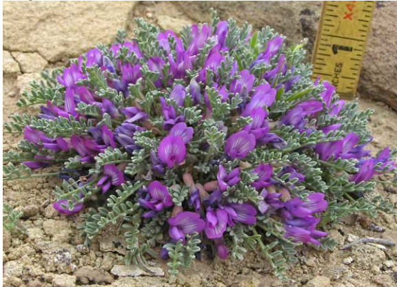
Figure 1: Mancos milkvetch ( Astragalus humillimus ).

Contributed by: USDA NRCS Colorado Plant Materials Program