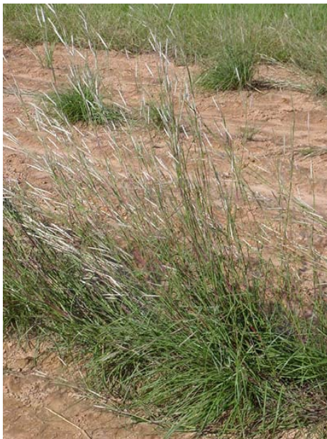
Melinda Brakie, East Texas Plant Materials Center

Contributed by: USDA NRCS East Texas Plant Materials Center