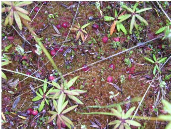
Small cranberries growing in a bog on the western Olympic Peninsula, Washington. Photograph by Jacilee Wray, 2006.

Contributed by: USDA NRCS National Plant Data Team, Greensboro, NC