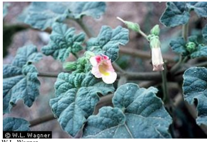
W.L. Wagner Smithsonian Institution, Botany Department

Found in disturbed dry places below 1000 m. in the deserts of southwestern California to Arizona, southern Nevada, to western Texas and northern Mexico. For current distribution, please consult the Plant Profile page for this species on the PLANTS Web site.