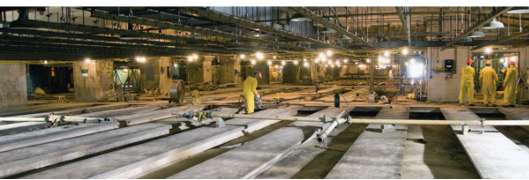
Department of Energy, Savannah River Site - R Reactor Disassembly Basin Grouting

To obtain more information about program eligibility, benefits for eligible workers, or how to file a claim, please refer to the DOL Web site at http://www.dol.gov/owcp/energy/index.htm or contact your local DOL Resource Center. A list of DOL Resource Centers, along with contact information, is included at the end of this pamphlet in attachment 1.