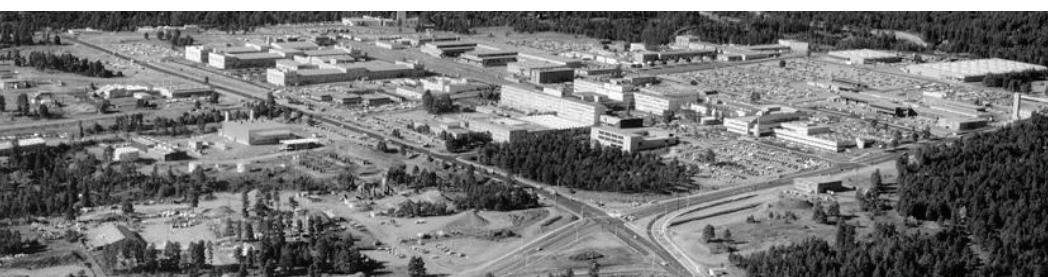
Department of Energy, Los Alamos National Laboratory Circa 1963