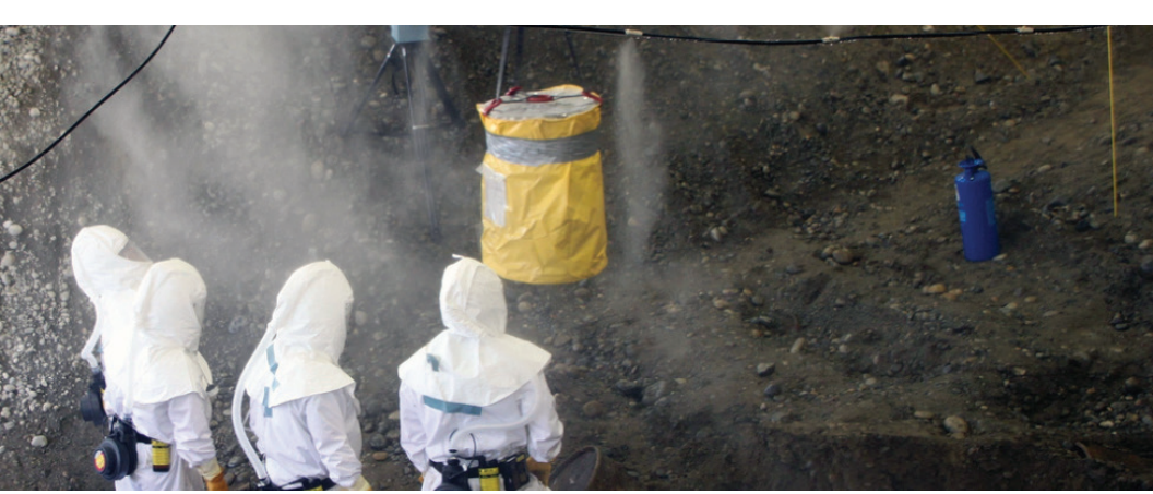
Department of Energy, Hanford Site - Richland

Additionally, DOE has launched an aggressive outreach and awareness campaign to ensure that current DOE contractors and subcontractors recognize the importance of the records they generate and are committed to providing access to these records.