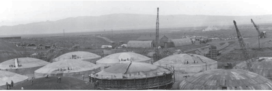
Hanford Tanks circa 1944 Under Construction

Part E of the Act was created as an amendment to EEOICPA in October 2004, transferring the old part D from DOE to DOL. Part E provides coverage to DOE contractor or subcontractor employees, or a RECA section 5 uranium worker who developed an illness, including cancer, beryllium disease, and silicosis, as a result of occupational exposure to a toxic substance at a covered DOE facility.