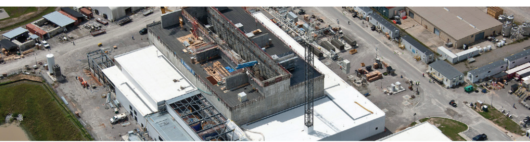
Department of Energy, Savannah River Site - Salt Waste Processing Facility (SWPF)

https://ehss.energy.gov/Search/Facility/findfacility.aspx