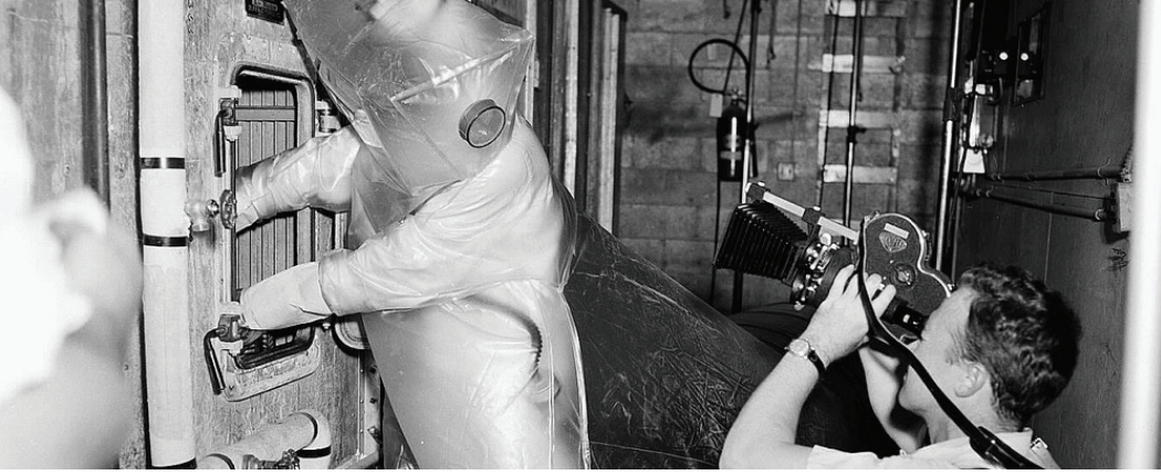
Department of Energy, Hanford Site