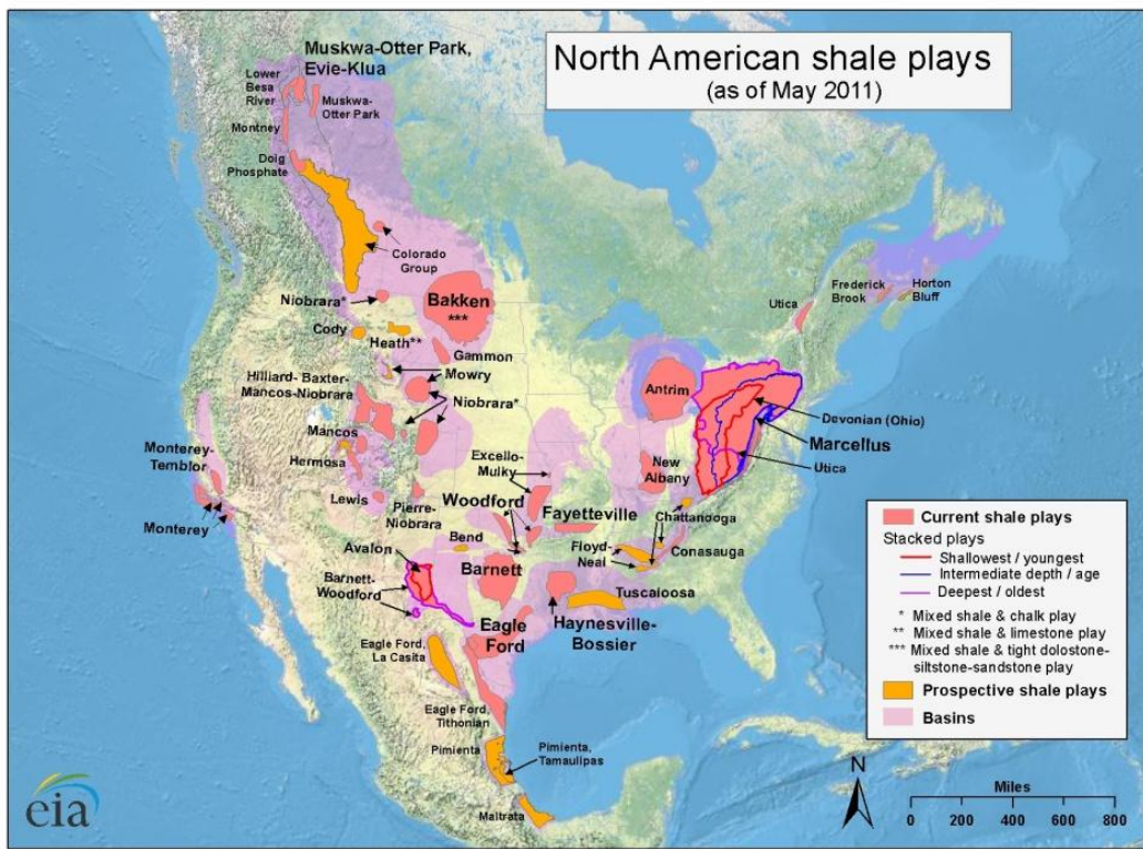
Source: U.S. Energy Information Administration based on data from various published studies. Canada and Mexico plays from ARI. Updated: May 9, 2011

Domestic production of shale gas also has the potential over time to reduce dependence on imported oil for the United States. International shale gas production will increase the diversity of supply for other nations. Both these developments offer important national security benefits. 2