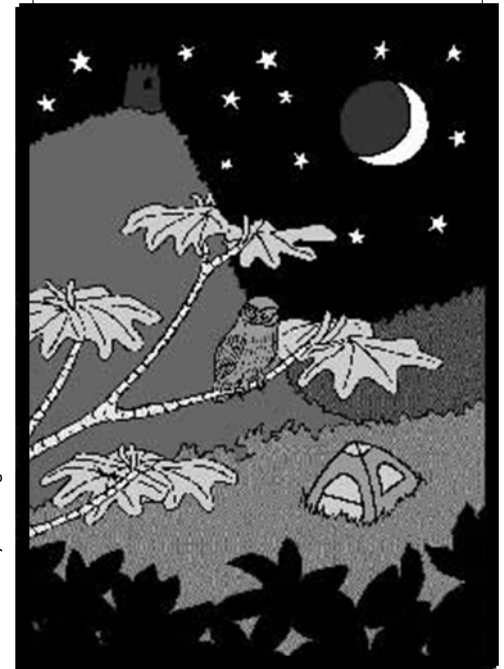
Illustration by A. Moragon

El Yunque only offers undeveloped camping. There are no toilet facilities, treated water, picnic tables or shelters in any of the camping sites . Check with camping officials for availability or last minute closures .