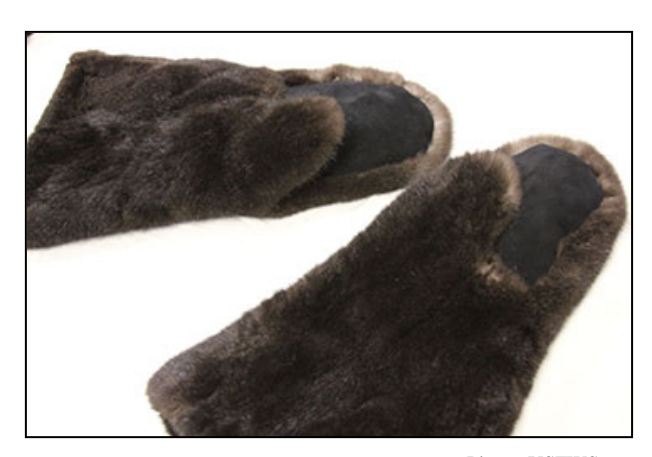
Page 3 of 7

Gloves—made from a sea otter pelt that has been cut into pieces and sewn. SIGNIFICANTLY ALTERED