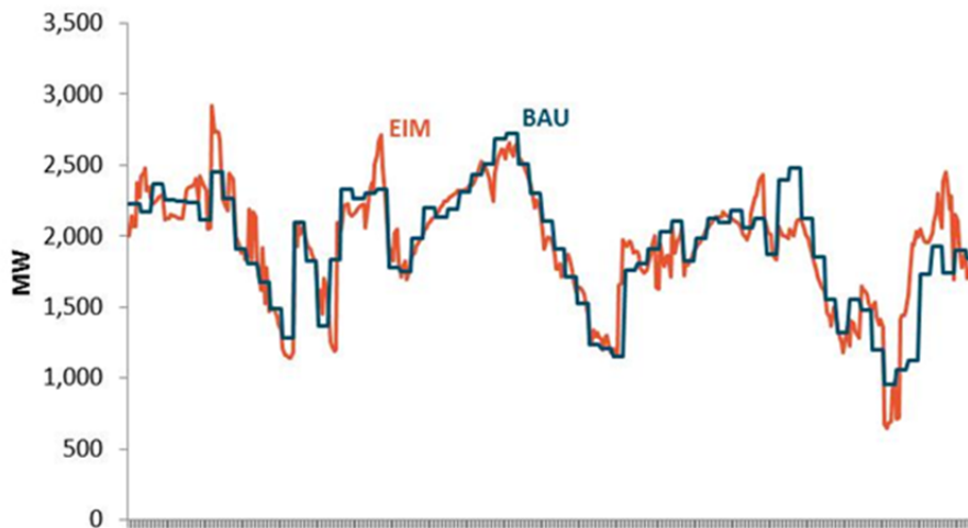
Figure 2. APS Net Exchange for Three-Day August Period

Additionally, EIM participation enables APS to import low-cost power from the other EIM participating BAAs during hours when those BAAs have lower cost