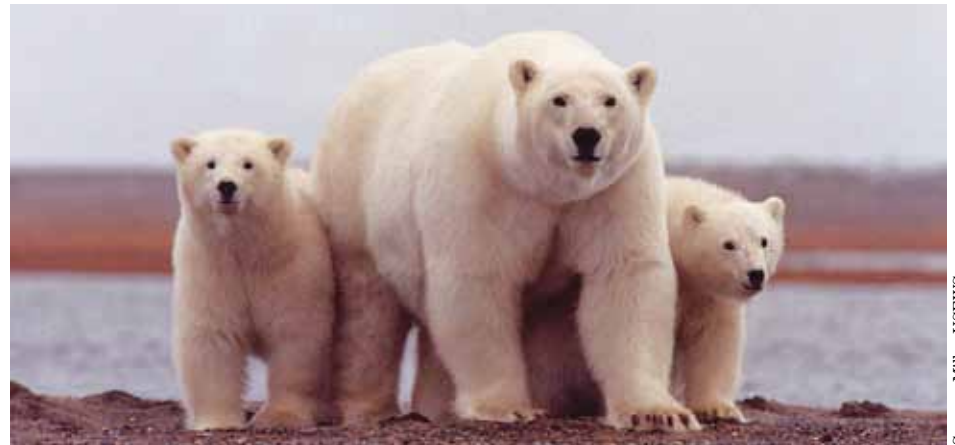
Susanne Miller, USFWS

A species is listed under one of two categories, endangered species or threatened species, depending on its status and the degree of threat it faces. An "endangered species" is one that is in danger of extinction throughout all or a significant portion of its range. A "threatened species" is one that is likely to become endangered in the foreseeable future throughout all or a significant portion of its range. To help conserve genetic diversity, the ESA defines "species" broadly to include subspecies and (for vertebrates) distinct populations.