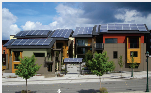
WaterSense labeled zHome community in Issaquah, Washington, built by Ichijo USA.

Builder partner Ichijo USA earned the WaterSense label for every home within its zHome community in Issaquah, Washington, in January 2012—a WaterSense first. Its zHome was also the first net-zero-energy townhome community in the United States and received the Forest Stewardship Council's 2011 award for the best residential project in North America. In addition to their energy efficiency, zHomes include WaterSense labeled products, efficient hot water delivery, and water-efficient landscape design required by the WaterSense specification, as well as a rainwater catchment system and other water-saving features. The rainwater is used to flush toilets and wash laundry, and utility-supplied water meets the remaining homeowner water needs.