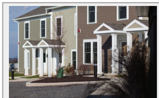
Homes in the Holly Creek Townhomes community in Ithaca, New York, optimize water and energy efficiency, earning both the WaterSense label and ENERGY STAR® certification.

Green building programs allow home buyers to identify desirable features, including criteria from the U.S. Environmental Protection Agency (EPA), the U.S. Green Building Council (USGBC)'s LEED® for Homes and the National Association of Homebuilders (NAHB) International Code Council (ICC) 700 National Green Building Standard (NGBS™) . The WaterSense New Home Specification complements the water efficiency criteria of LEED, NGBS, and other green building programs. As a result, builders constructing homes to the LEED for Homes rating system or NGBS Green Home certification criteria might already be meeting many elements of the WaterSense specification, making the WaterSense label only a few additional steps away.