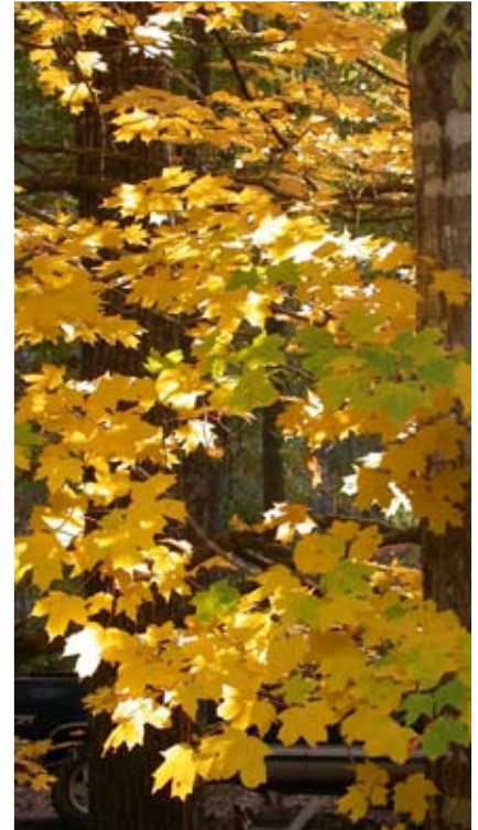
Some plants perform well with only occasional irrigation.