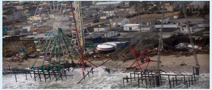
Seaside Heights in the aftermath of Hurricane Sandy.

Wind speeds and rainfall intensity during hurricanes and tropical storms are likely to increase as the climate warms. Rising sea level is likely to increase flood insurance rates, while more frequent storms could increase the deductible for wind damage in homeowner insurance policies.