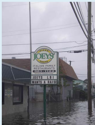
A flooded restaurant on Long Beach Island.

As sea level rises, coastal homes and infrastructure flood more often because storm surges become higher as well. Although hurricanes are rare, homes along the ocean are vulnerable to erosion and storm waves. The bay sides of several barrier islands are so low that some streets and yards flood at high tide when strong winds blow from the east. During Hurricane Sandy, flooding and storm waves destroyed coastal homes and recreational facilities, washed out roads, inundated rail tunnels, and damaged essential power and wastewater management infrastructure.